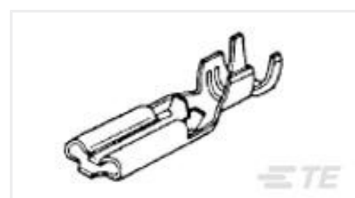
TE Part #174777-1 PL 110 REC 20-16 AWG 0.25 X 10.4 PTBR