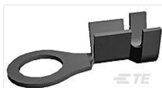
TE Part #61588-1 RING 22-16 AWG TPBR