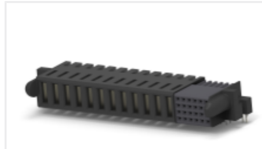
TE Part #1-6450871-1 MBXLE R/A RCPT 24S+12HDP