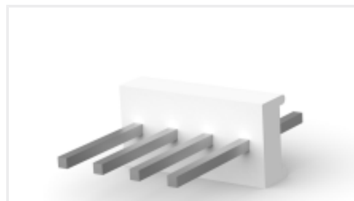
TE Part #CAT-104MTA-PVUNH PCB Header: Polyester, Vertical, Unshrouded, No Mating Alignment