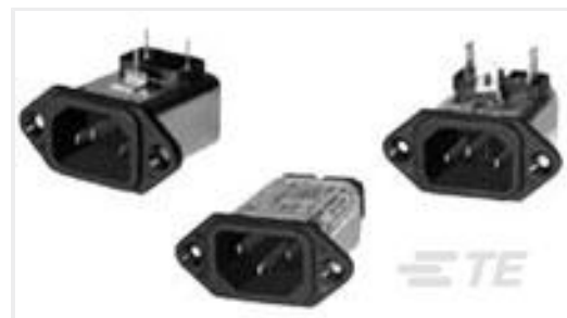
TE Part #1-6609001-2 10EEBP=F7656 S0