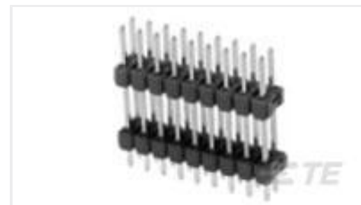
TE Part #1-146490-2 24 MODII HDR DRST UNSHRD STKG