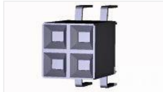
TE Part #6-534267-7 04 MODIV VRT DR DE 100/125