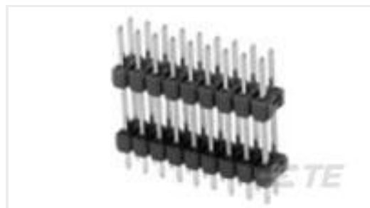
TE Part #146490-5 10 MODII HDR DRST UNSHRD STKG