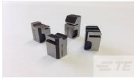
TE Part #465324-1 FLOATING SHEAR