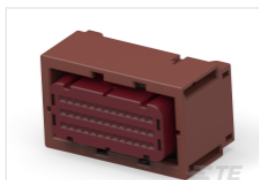
TE Part # 4-2309307-1 GET 39P PLUG ASSY B3B9