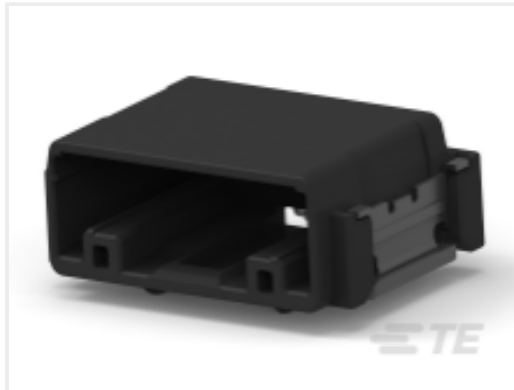
TE Part #2237145-1 8POS, TAB0.64X0.64, HDR ASSY, 90DEG, SMD