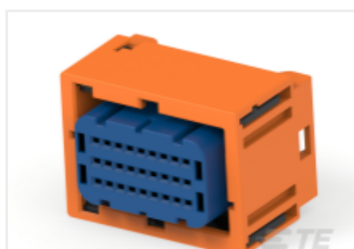
TE Part # 5-2309306-2 GET 27P PLUG ASSY A5A7