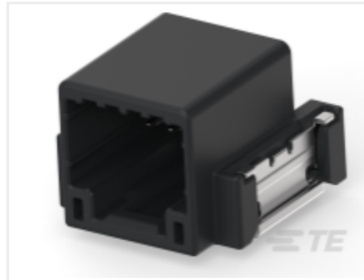
TE Part #2237149-1 8POS, TAB0.64X0.64, HDR ASSY, 90DEG, SMD