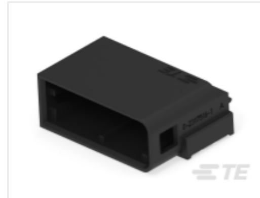
TE Part #2317515-1 2X10POS, NANOMQS, HDR ASSY, 90DEG, SMD, COD A