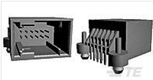
TE Part #185740-2 12pos MQS .63 header 90deg