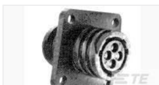
TE Part #182641-1 17-14 CPC SQ FLANGE RECPT RS