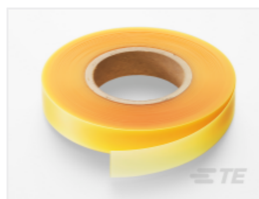
TE Part #890113-000 S1048-TAPE-1X100-FT