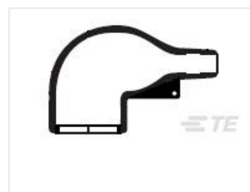
TE Part #810028-000 222K121-3/86-0