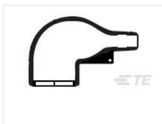
TE Part #822840-000 222K132-3-0