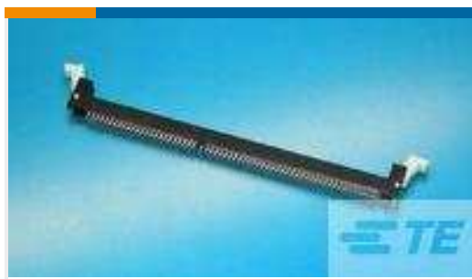
TE Part #1-1932000-0 VERTICAL DDR3 DIMM, 240 POSITION