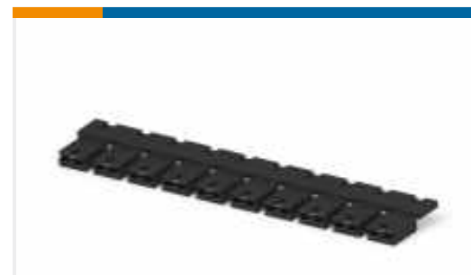
TE Part # 382811-8 SHUNT, ECON, PHBR 5AU, BLACK