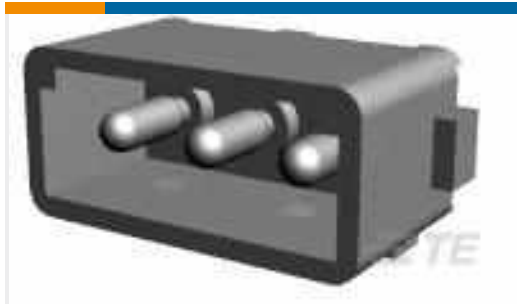
TE Part #1586514-2 03P CMNL HDR ASSY PC NATL LF