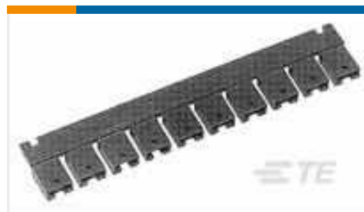
TE Part # 1-382811-8 SHUNT, ECON, PHBR 5AU, BLACK L/P