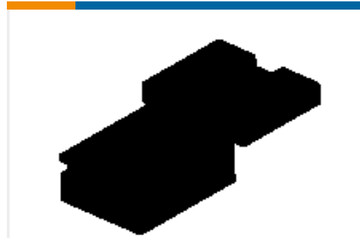
TE Part # 390088-2 BLACK HSG WITH 15AU CONTACT