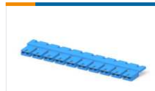
TE Part # 382811-2 SHUNT, ECON, PHBR15 AU, BLUE