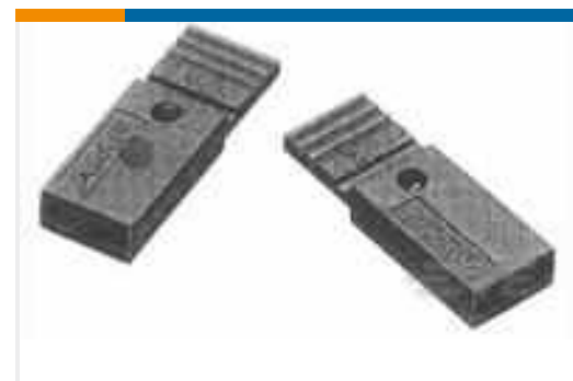
TE Part # 880584-5 SHUNT CONNECTOR