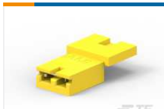
TE Part # 390088-6 YELLOW HSG WITH 15AU CONTACT