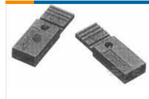
TE Part # 1-880584-1 SHUNT CONN. ASS'Y