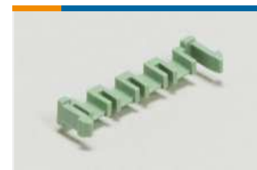
PCB Latches, Locks & Retainers(2)