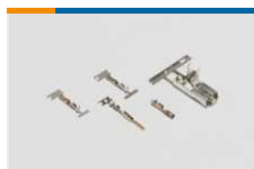
Wire-to-Board Connector Contacts(66)