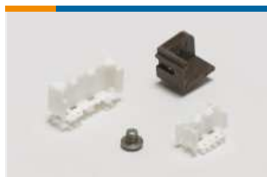
PCB Connector Mounting(1)