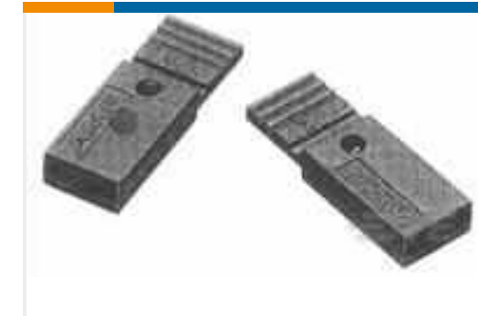
TE Part # 2-880584-1 SHUNT CONN. ASSY