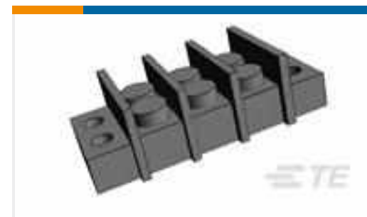
TE Part #1546306-3 3P .374" DR BARRIER STRIP