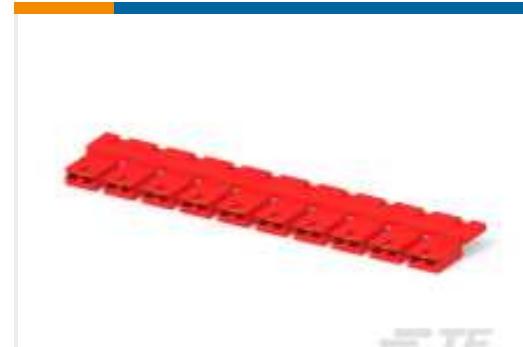
TE Part # 382811-9 SHUNT, ECON, PHBR 15AU, RED