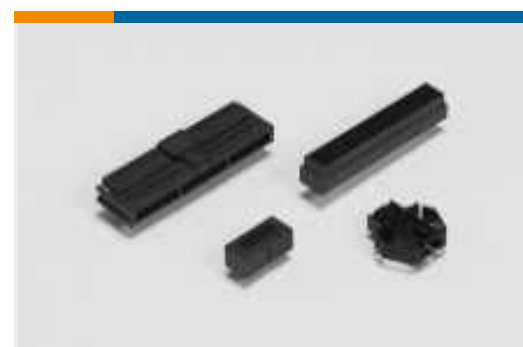
PCB Connector Shrouds(1)