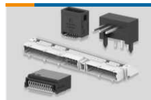
PCB Headers & Receptacles(6117)