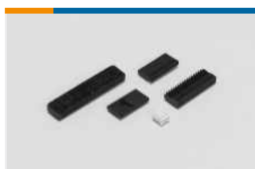
Wire-to-Board Connector Assemblies & Housings(5)