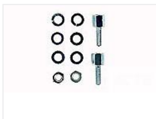
TE Part #5207872-3 KIT SCREWLOCK FEMALE (METRIC)