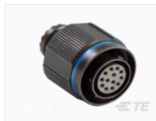
TE Part #YDTS26F21-11PAV001 PLUG ASSY