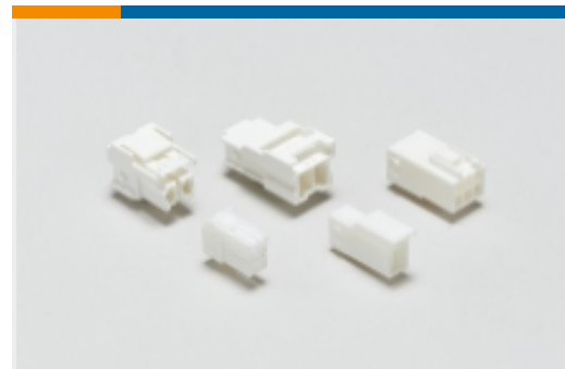
Rectangular Power Connectors(43)