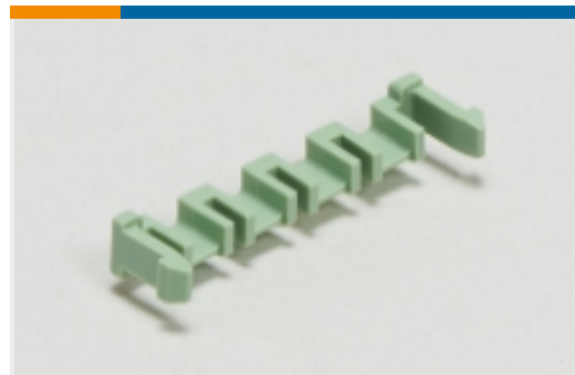
PCB Latches, Locks & Retainers(49)