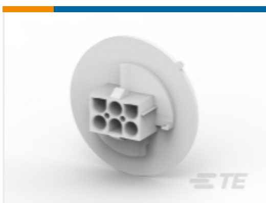
TE Part #1969881-1 06P UMNL CAP HSG, P/M, GW V0