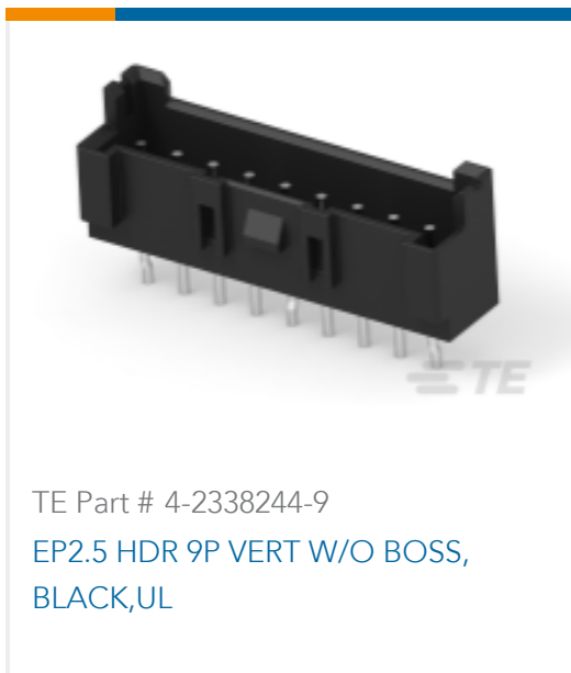
TE Part # 4-2338244-9 EP2.5 HDR 9P VERT W/O BOSS, BLACK,UL