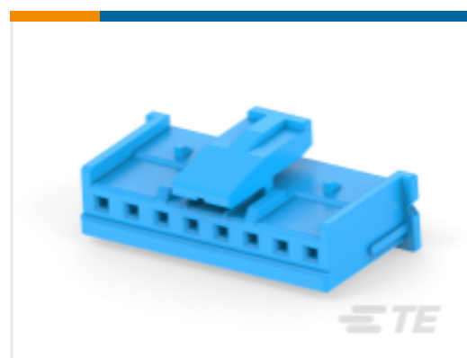
TE Part #2-2338183-8 EP 2.5 HOUSING 8P, BLUE, UL version