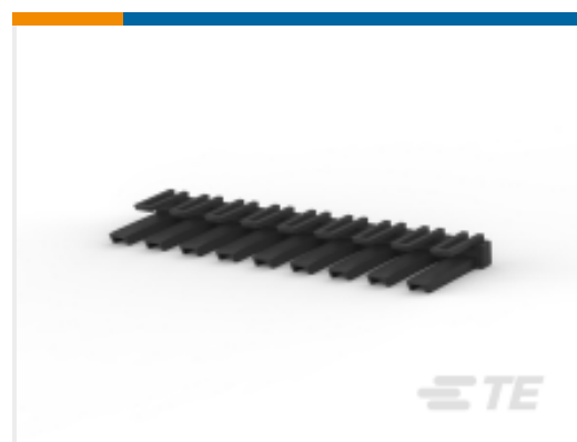
TE Part #1744544-9 EP II TPA 09P, BLACK