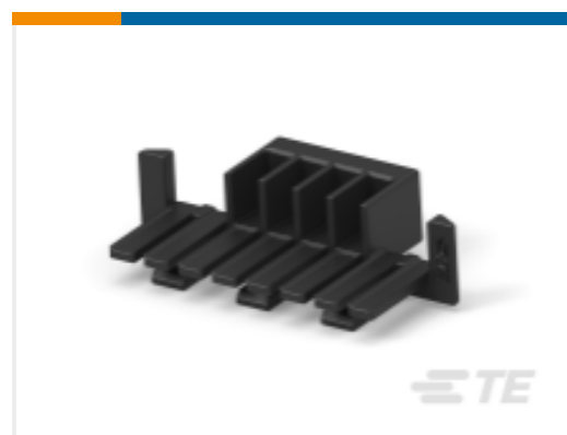
TE Part #1969825-8 EP 2.5 TPA RETAINER, 8 POS