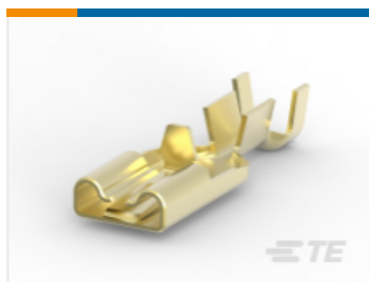
TE Part #2238155-2 POS LOCK 250 Rec, MKII, 18-14 BR