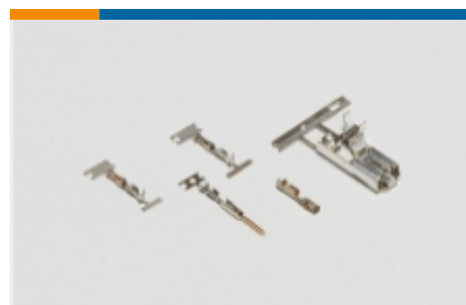
Wire-to-Board Connector Contacts(6)