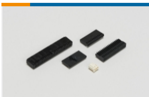
Wire-to-Board Connector Assemblies & Housings(216)