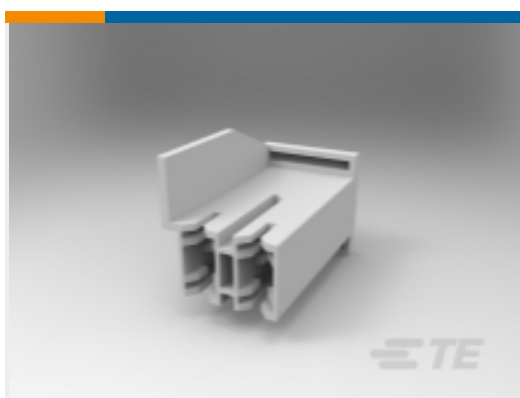
TE Part #1-1969717-1 HSG, REC., POS-LOCK, MK I 2P, 6.35 SR NAT