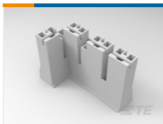
TE Part #1969761-1 4P POSITIVE LOCK HSG, MARK II