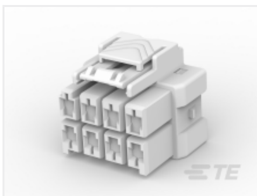
TE Part #CAT-P87074-P729 POWER TRIPLE LOCK Plug, Standard Temperature