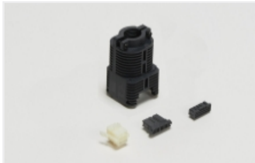
Rectangular Connector Housings(280)