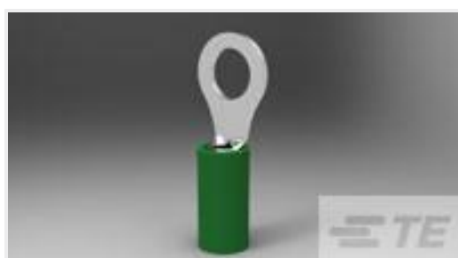
TE Part #50832-1 TERMINAL,PIDG PTFE R 22-20 10