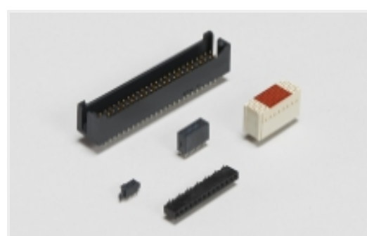
Board-to-Board Headers & Receptacles(46)