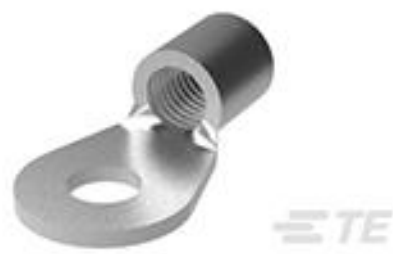
TE Part # 323987 TERMINAL,BUDG R 24-20 8