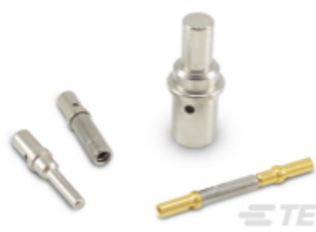
TE Part #0462-201-20141 DEUTSCH SOLID CONTACTS