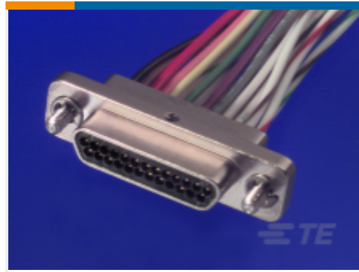
TE Part #1-1532174-7 M83513/04-D01C, MCKS-C2-B-25S6G1-18.0