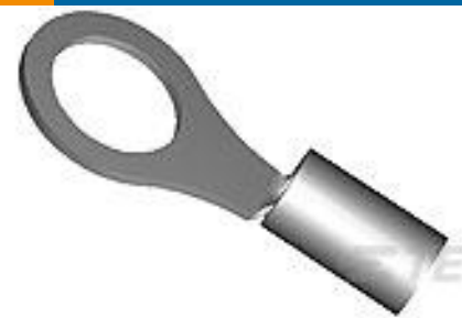
TE Part # 55215-1 TERMINAL,SOLIS R 26-22 2