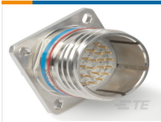
TE Part #YDTS20F15-35PD0000 D38999: Square Flange, 15-35 insert