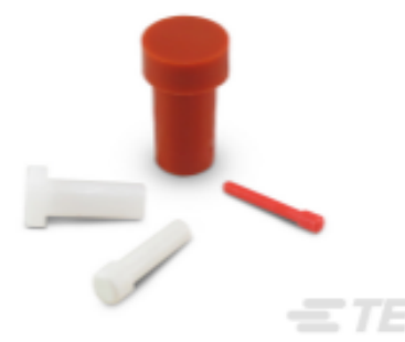
TE Part #114017-ZZ DEUTSCH SEALING PLUGS