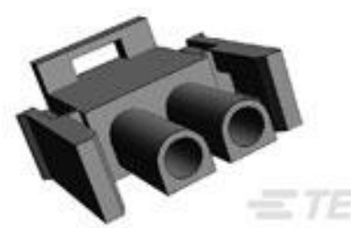
TE Part #1-480698-0 02P UMNL PLUG HSG NATL