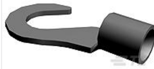
TE Part # 34261 TERMINAL,BUDG HK 22-16 6