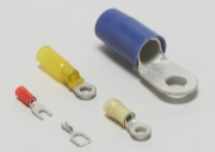
Rings & Spades(181)