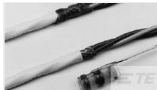
TE Part #866259N005 S02-08-RCS453