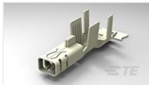
TE Part #1971785-2 PTL RECEPTACLE CONTACT, 20 - 24 AWG