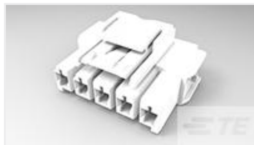
TE Part #1-1971773-7 PTL 1X5 PLUG HSG STD TEMP KEY A NAT