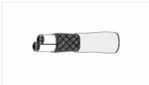
TE Part #596241-000 55A1821-12-9/96-9CS2275