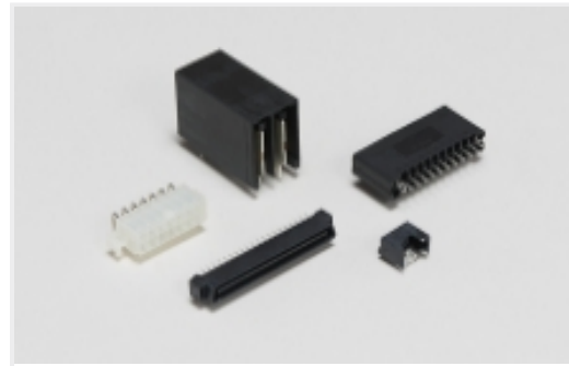
Standard Rectangular Connectors(280)