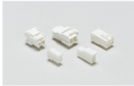
Rectangular Power Connectors(301)