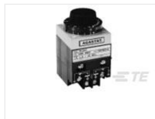
TE Part #6-1755142-4 7022WDIM=RLY,STD,OFF,2P,96V,50S,I, M