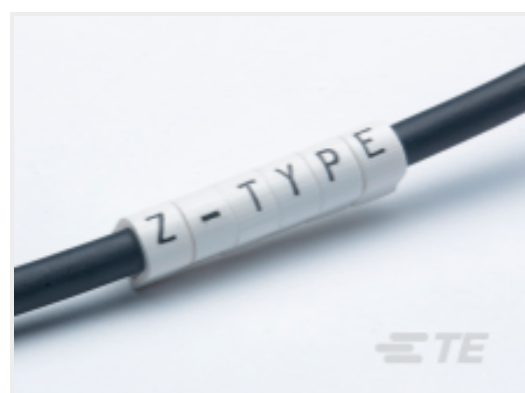
TE Part #EC0437-000 06153411