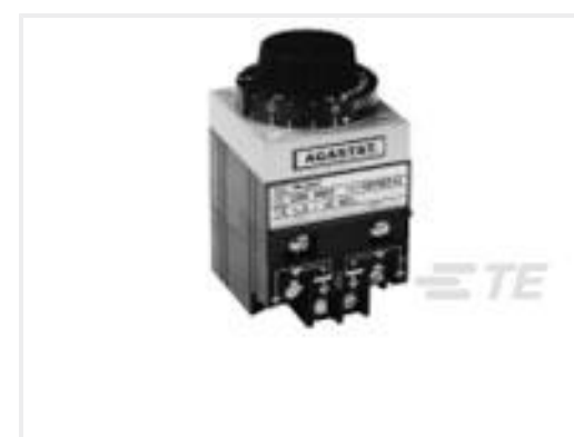
TE Part #6-1755142-4 7022WDIM=RLY,STD,OFF,2P,96V,50S,I, M