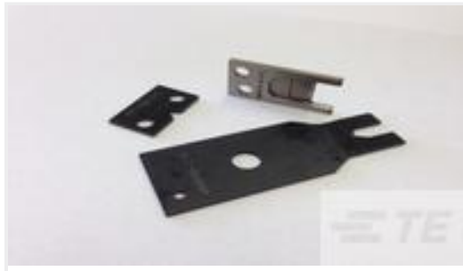
TE Part #2217206-6 Blade, Slug