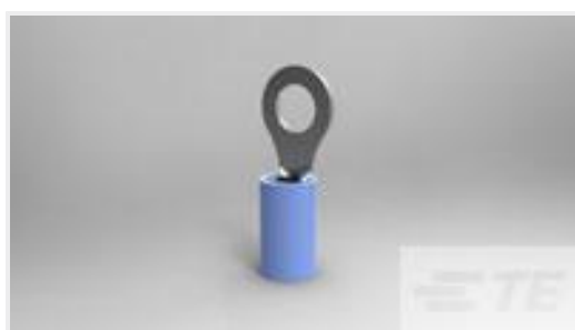
TE Part #51864-4 TERMINAL,PIDG R 16-14 10