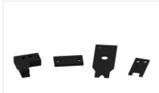
TE Part #2161335-2 SHEAR PLATE, REAR