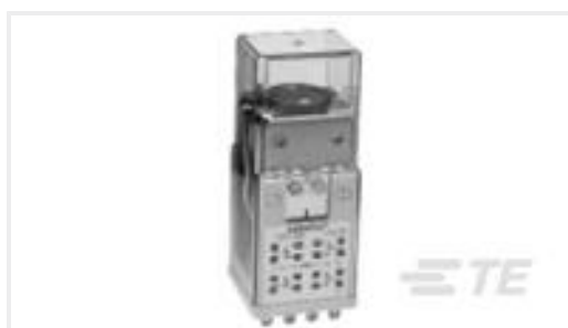
TE Part #1423155-6 GPDN=RLY,GEN,PURP,125VDC