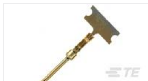
TE Part #66507-9 PIN CONTACT, 20 DF