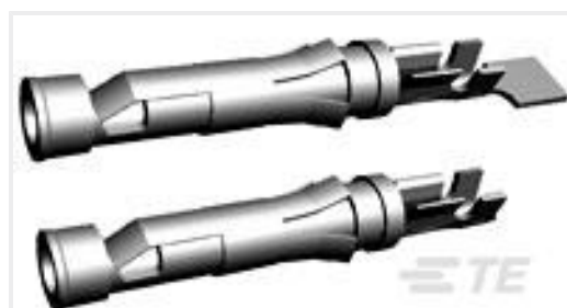
TE Part #66399-3 III+ SKT,24-20,15AU/FL,LP