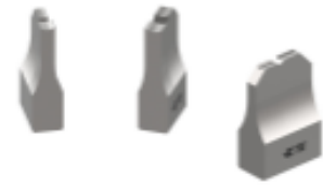
ANVIL REPRESENTATION ONLY