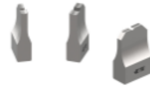
ANVIL REPRESENTATION ONLY