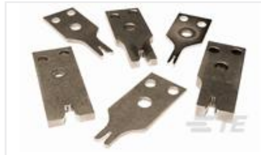
TE Part #1-1633965-0 CRIMPER, INSUL O PREMIUM