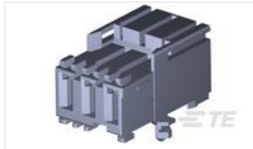
TE Part #1534077-3 MULTIFIT MK2ASSY 3P,IR