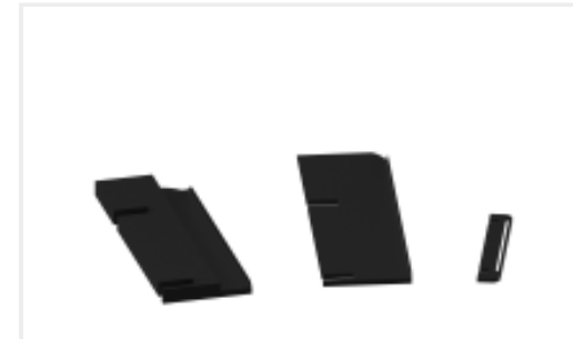
TE Part #1320928-2 STRIP GUIDE