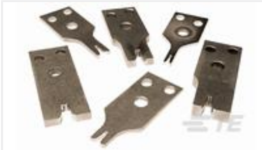
TE Part #1633989-4 Crimper, Insulation ,Special