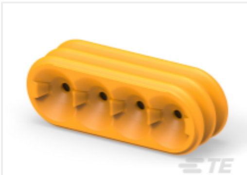
TE Part #2443732-4 REAR WIRE SEAL 4PIN