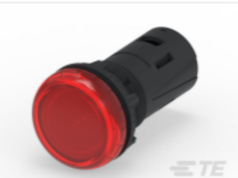
TE Part #2489541-1 LED INDICATOR RED 12V AC/DC