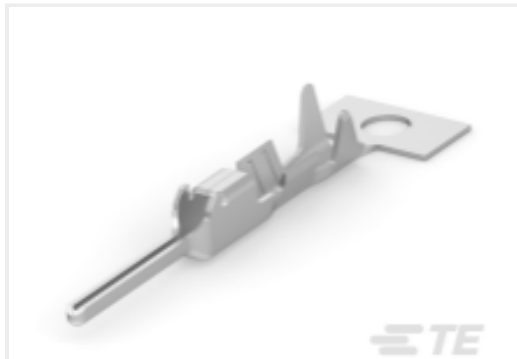
TE Part #2443728-1 TAB TERMINAL SDL2.5 WATERPROOF