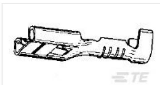
TE Part #962834-1 FF 374 REC 2.5-4 MM2 PLAIN CUSN4