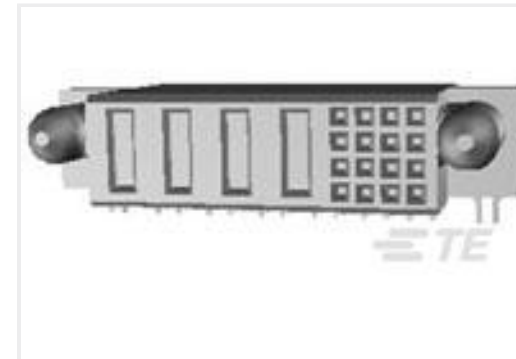
TE Part #1-6450161-3 MBXL R/A RCPT 16S+4P