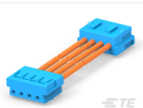
TE Part #2405869-4 CT 4P 300MM CABLE ASSEMBLY 2- 179228-4