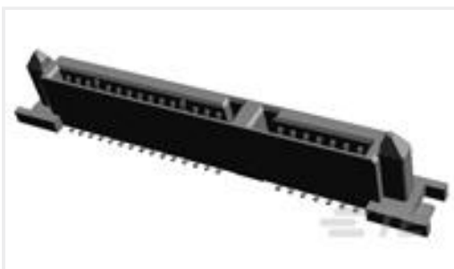
TE Part #1735284-5 SATA BACKPLANE RECEPTACLE, VERTICAL, SMT