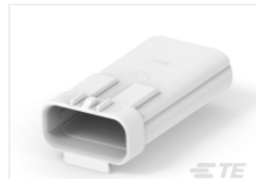
TE Part #2443725-4 CAP HOUSING FREE HANGING 4PIN