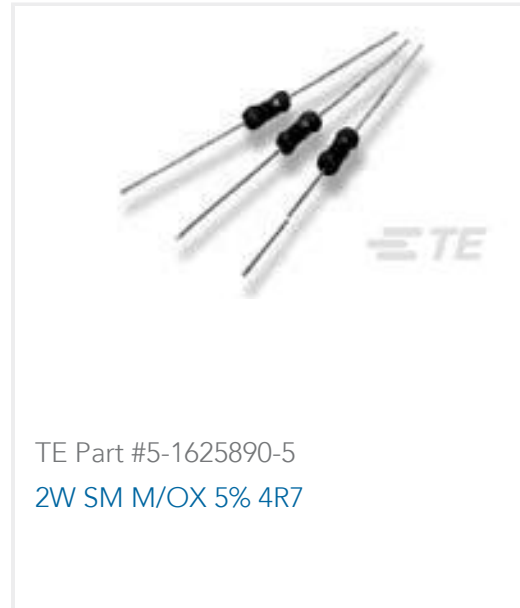
TE Part #5-1625890-5 2W SM M/OX 5% 4R7