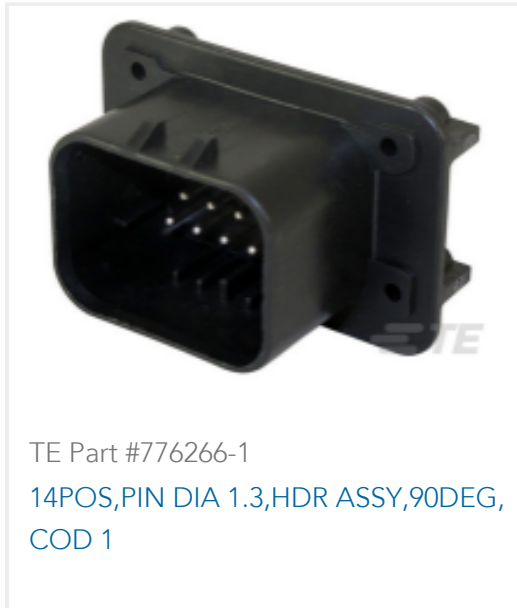
TE Part #776266-1 14POS,PIN DIA 1.3,HDR ASSY,90DEG, COD 1