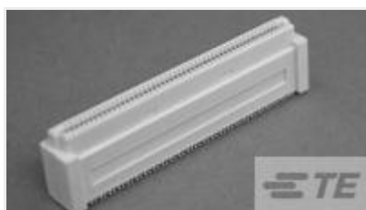
TE Part #1735805-5 0.8FH,R13H.5,120,08/Sn,TR,WSC