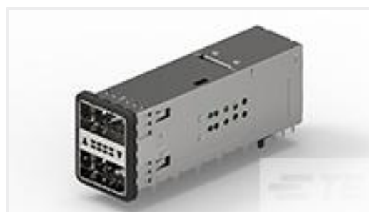
TE Part #2198373-2 zOSFP+ STACKED RECEPTACLE ASSEMBLY 2X1