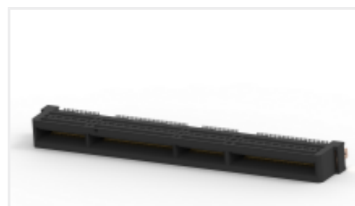
TE Part #2333799-3 RCPT ASSY, VERT, 168 POS, SLIVER 2.0