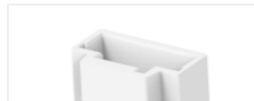
TE Part #1-2232826-5 SGI2.0 header assembly TH 5P,key A, NTL