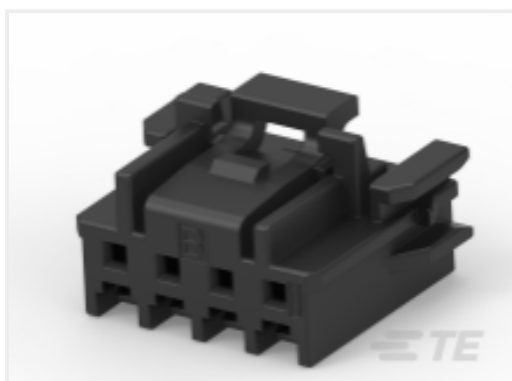
TE Part #2-2350224-4 SGI 2.0 Plug Housing, 4 Position, Key B