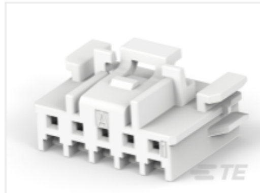
TE Part #1-2350224-5 SGI 2.0 Plug Housing, 5 Position, Key A