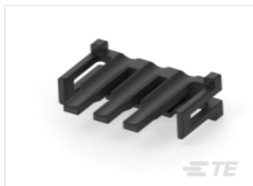
TE Part #2357686-3 SGI 2.0 Crimp TPA