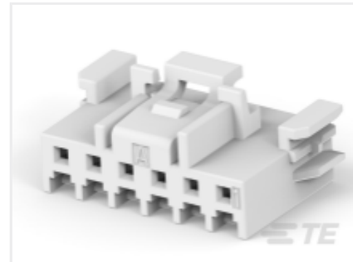
TE Part #1-2350224-6 SGI 2.0 Plug Housing, 6 Position, Key A