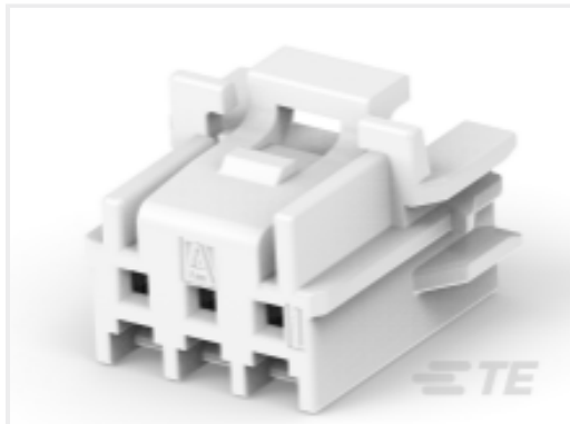
TE Part #1-2350224-3 SGI 2.0 Plug Housing, 3 Position, Key A