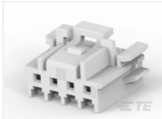
TE Part #1-2350224-4 SGI 2.0 Plug Housing, 4 Position, Key A