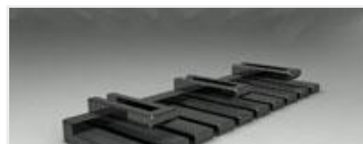
TE Part #1969443-9 EP 2.5 TPA Retainer, 9 Pos