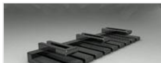
TE Part #1969443-8 EP 2.5 TPA Retainer, 8 Pos