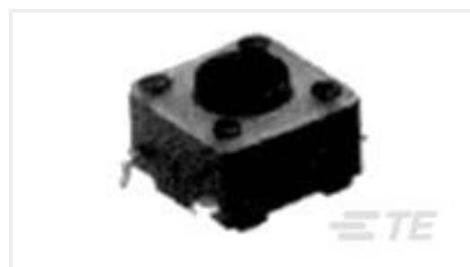
TE Part #4-1437565-2 FSM4JSMATR=TACT SWITCH 6X6MIL