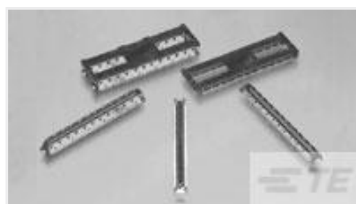
TE Part #3-1827231-6 .5FHR04H,440,B,GIG,08/Sn,HT,NS