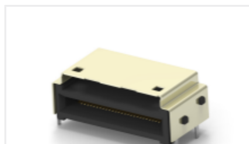
TE Part #1-2332208-3 RECEPT ASSY, RA, 56 POS, SLIVER 2.0