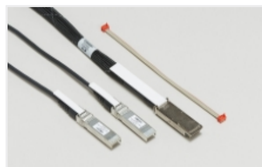
Pluggable I/O Cable Assemblies(39)