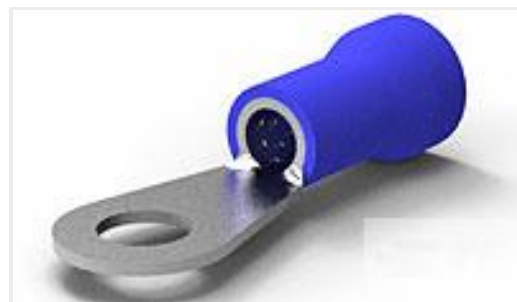
TE Part #52264 TERMINAL R PG 6 5/16