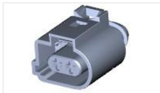
TE Part #2-1355200-1 MCP2,8BU-GEH ASSY2P