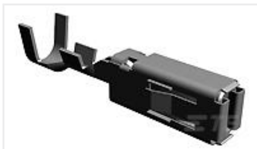
TE Part #1-968857-3 AMP MCP 2.8, CONTACT SWS