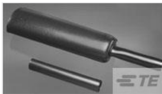
TE Part #397892-000 RMW-16/5-1200/ADH-0