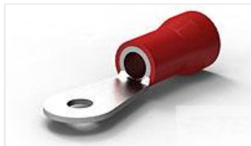
TE Part #52041-1 TERMINAL,R PG 8 1/4