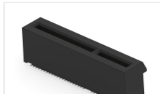
TE Part #5-2364427-2 PCIE G5 CON,SMT,64P,30°,10 MYLAR, ST