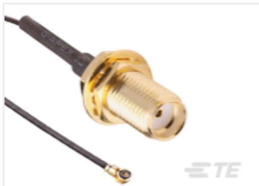
TE Part #CSJ-SGFB-200-MHF4 SMA to MHF4 200mm 0.81 OD