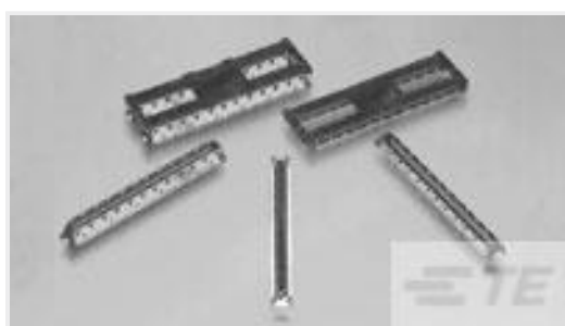
TE Part #3-6318490-6 .5FHR04H,220,S,GIG,08/Sn,HT,NSYes