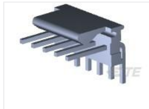
TE Part #3-641216-5 OSP MTA100 HDR ASSY FL/RA LF