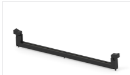
TE Part #6-2355626-4 DDR5 DIMM BLACK HSG AND BLACK LATCH