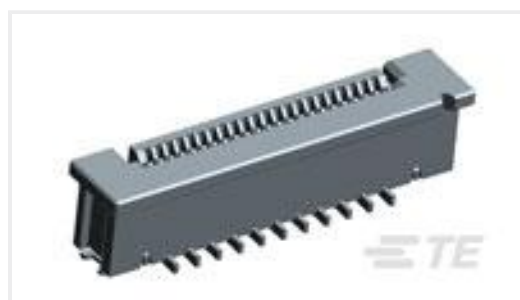
TE Part #4-1734742-0 .5 FPC VT ZIF Type-A 40 CONT