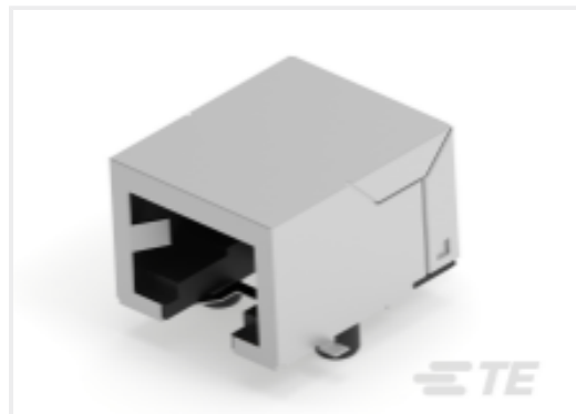
TE Part #133611-E MJ LSS ** 8 8 *** STP * 30 * J 3 2034