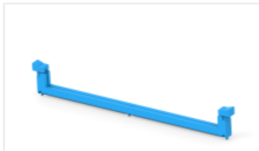
TE Part #6-2355644-4 DDR5 DIMM BLUE HSG AND BLUE LATCH