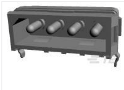
TE Part #174804-1 M-N-L PIN HDR W/FIX BELT H 4P