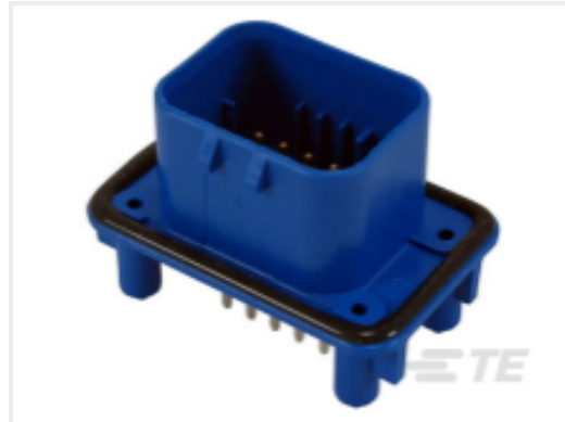
TE Part #1-776262-5 14POS,PIN DIA 1.3,HDR ASSY, 180DEG,COD 5