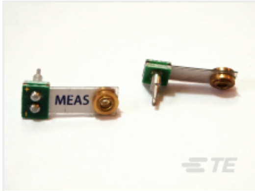
TE Part #1006015-1 LDTC-H,REDUCED HEIGHT