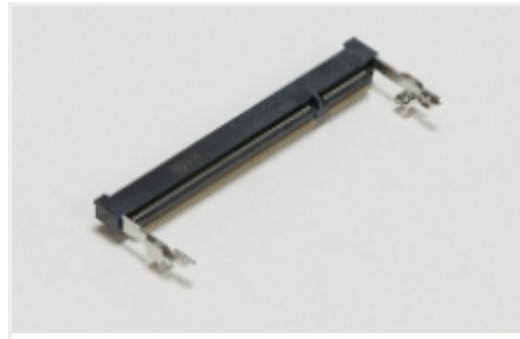
SO DIMM Sockets(39)