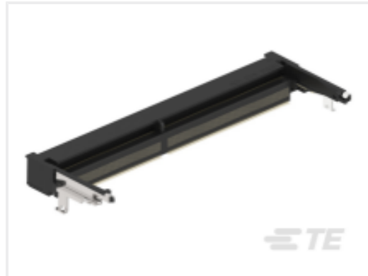
TE Part #2309412-3 DDR4 SODIMM 260P 8.0H RVS