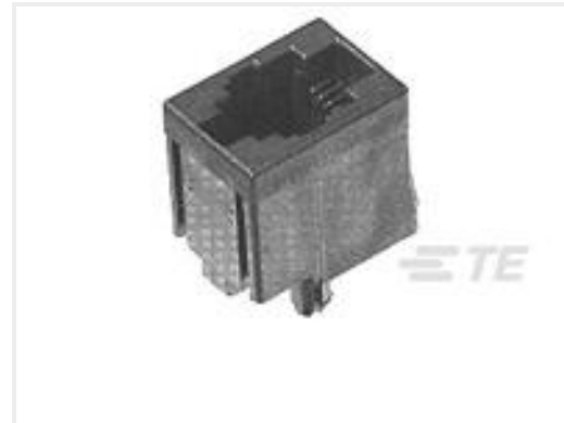
TE Part #5520425-3 MJ,TE,6P/6C,BULK PAC