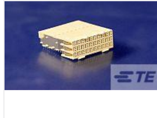
TE Part #2065883-1 Zd Plus, 3 pair receptacle ass