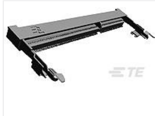
TE Part #2-2013290-1 EMBOSS TAPE DDR3 204P 5.2H RVS