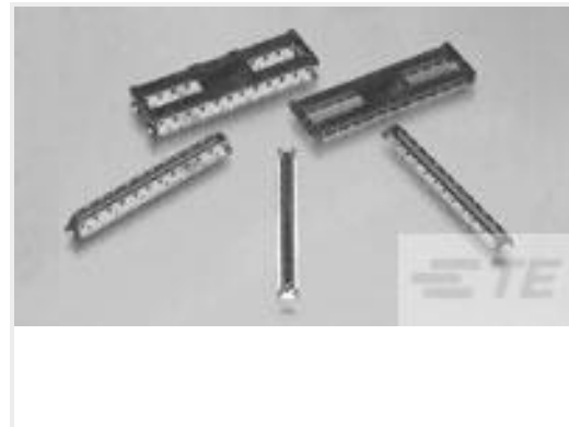
TE Part #3-5353652-6 .5FHP08H,440,B,GIG,08/Sn,HT,NSYes