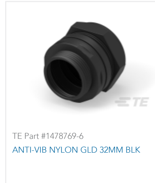
TE Part #1478769-6 ANTI-VIB NYLON GLD 32MM BLK