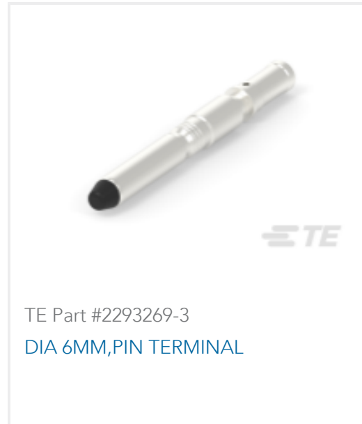
TE Part #2293269-3 DIA 6MM,PIN TERMINAL