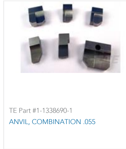
TE Part #1-1338690-1 ANVIL, COMBINATION .055