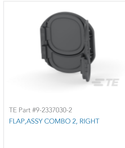
TE Part #9-2337030-2 FLAP,ASSY COMBO 2, RIGHT