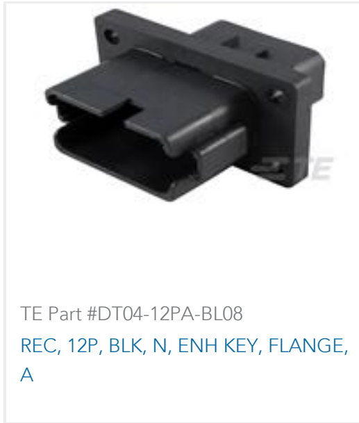
TE Part #DT04-12PA-BL08 REC, 12P, BLK, N, ENH KEY, FLANGE, A