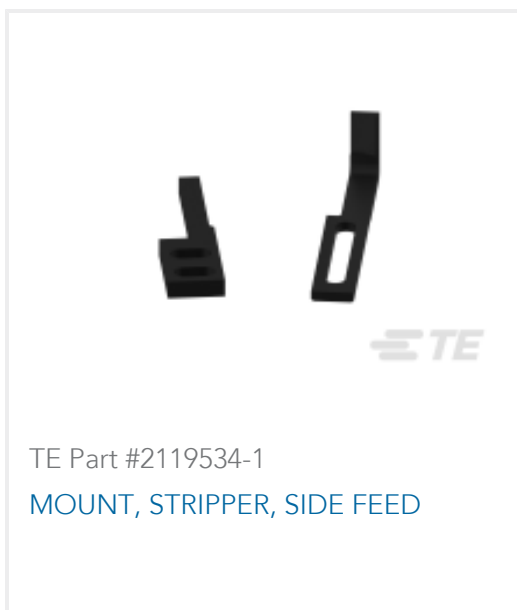
TE Part #2119534-1 MOUNT, STRIPPER, SIDE FEED