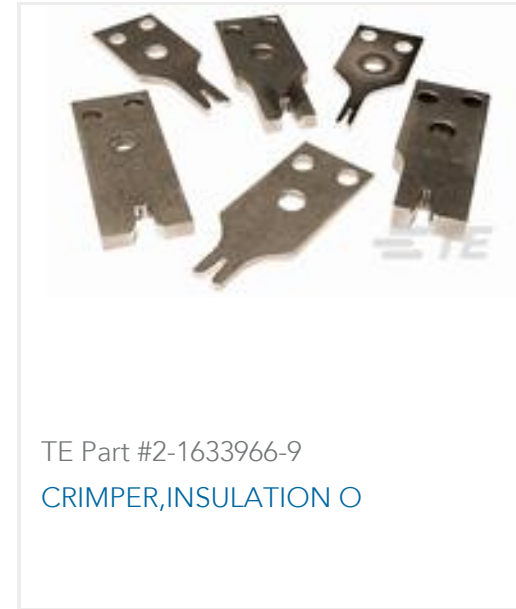
TE Part #2-1633966-9 CRIMPER,INSULATION O