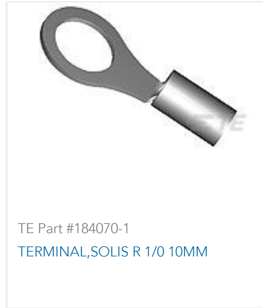
TE Part #184070-1 TERMINAL,SOLIS R 1/0 10MM