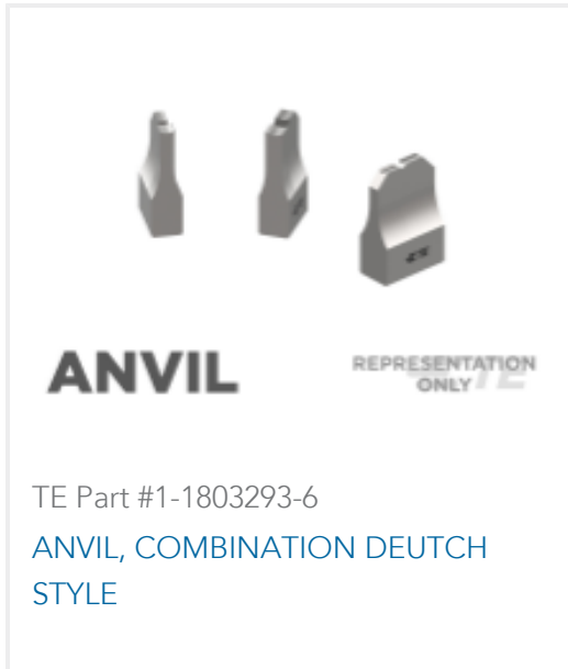
TE Part #1-1803293-6 ANVIL, COMBINATION DEUTCH STYLE