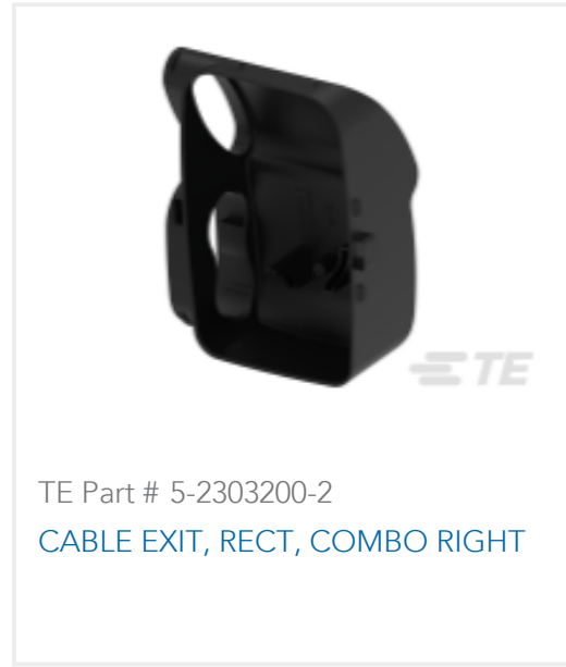
TE Part # 5-2303200-2 CABLE EXIT, RECT, COMBO RIGHT