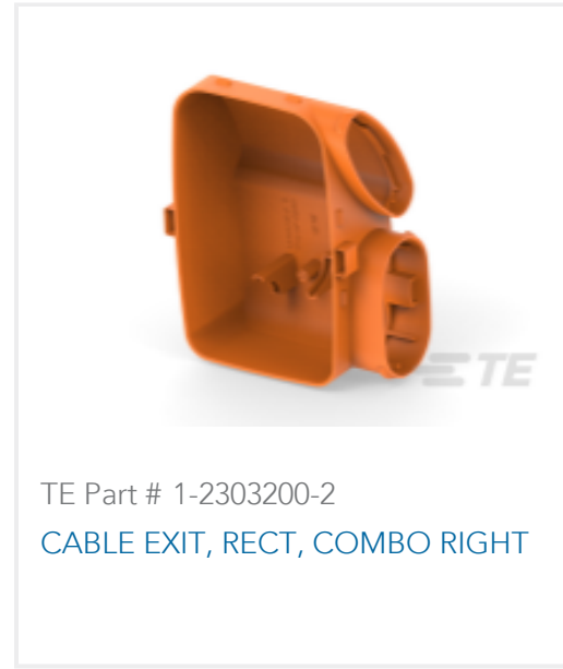
TE Part # 1-2303200-2 CABLE EXIT, RECT, COMBO RIGHT