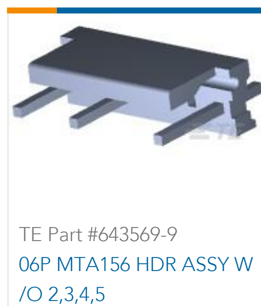
TE Part #643569-9 06P MTA156 HDR ASSY W /O 2,3,4,5