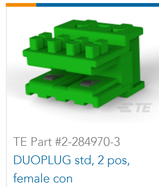
TE Part #2-284970-3 DUOPLUG std, 2 pos, female con