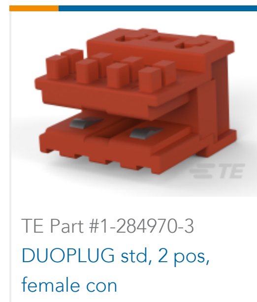
TE Part #1-284970-3 DUOPLUG std, 2 pos, female con