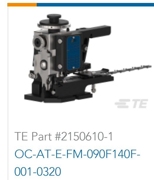
TE Part #2150610-1 OC-AT-E-FM-090F140F- 001-0320