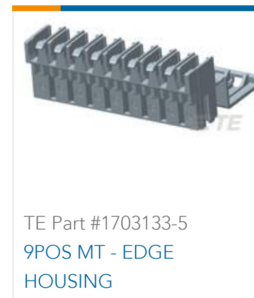
TE Part #1703133-5 9POS MT - EDGE HOUSING