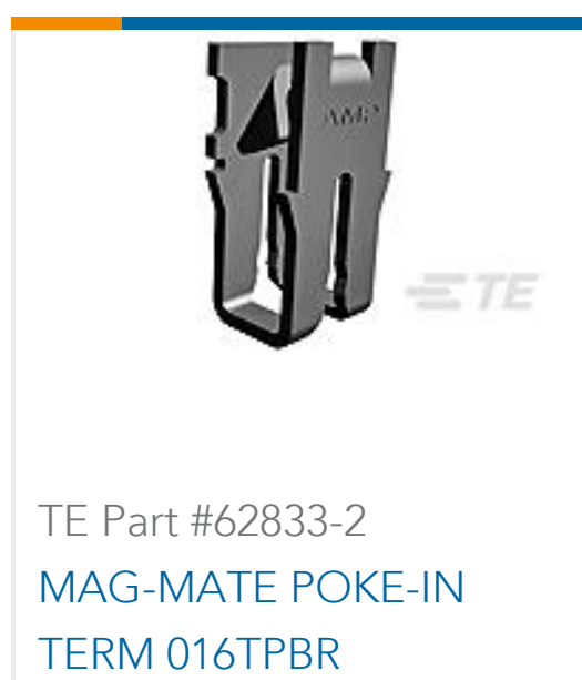
TE Part #62833-2 MAG-MATE POKE-IN TERM 016TPBR