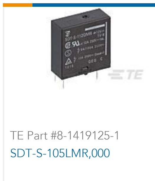
TE Part #8-1419125-1 SDT-S-105LMR,000