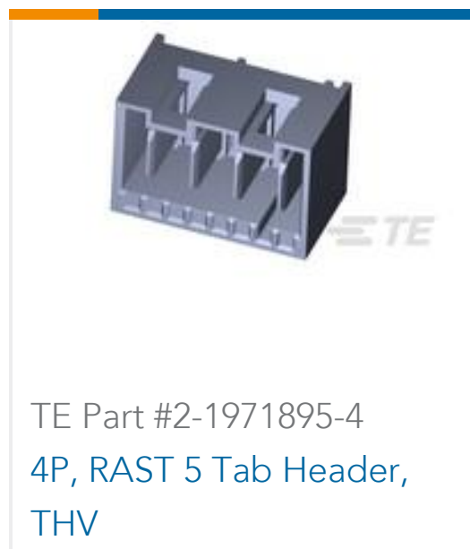
TE Part #2-1971895-4 4P, RAST 5 Tab Header, THV