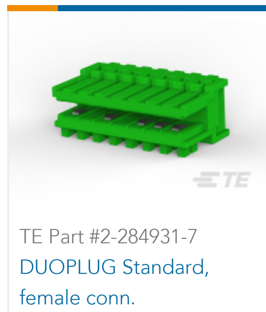
TE Part #2-284931-7 DUOPLUG Standard, female conn.