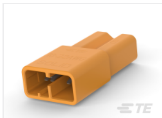
TE Part #2271183-1 RECEPTACLE, 2PINS WIRE TO WIRE CONNECTOR