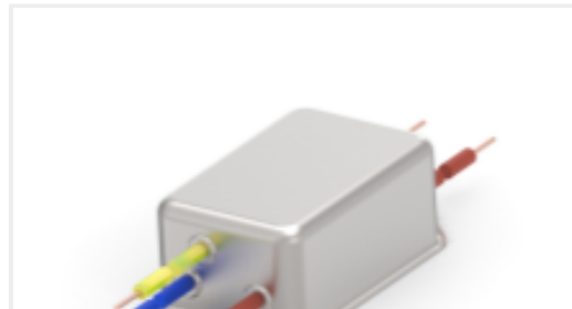
TE Part #3-1609028-1 5FBH3=F8591