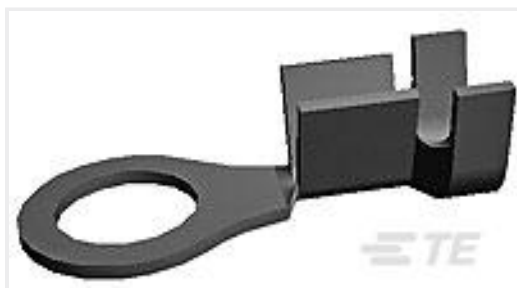
TE Part #41333 RING 18-14 AWG TPBR