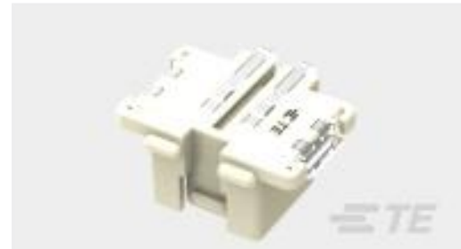
TE Part #2154829-1 High Power Inverted Thru Board Con 2 Pos