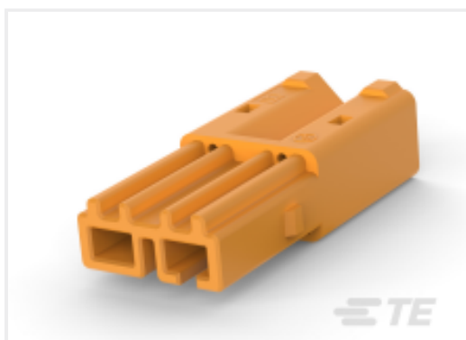
TE Part #2271180-1 PLUG, 2PIN WIRE TO WIRE CONNECTOR