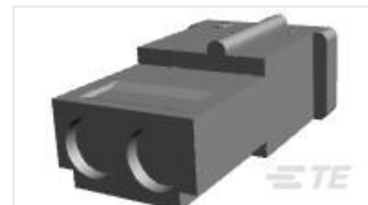
TE Part #1-480318-9 02P CMNL PLUG HSG F/H BLK