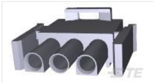
TE Part #1-480700-0 03P UMNL PLUG HSG NATL