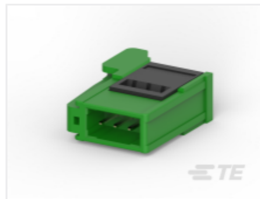
TE Part #4-2295044-3 RITS CONN. PLUG ASSY 3P GREEN TIN