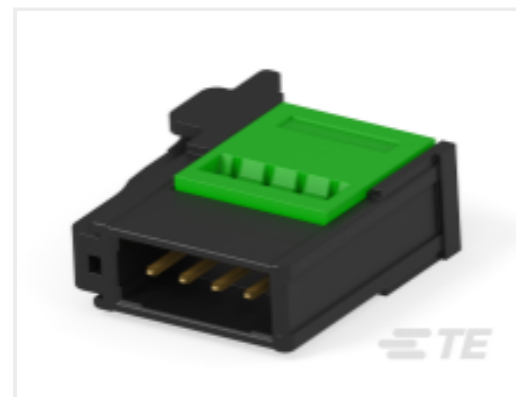
TE Part #4-2295044-4 RITS CONN. PLUG ASSY 4P GREEN TIN