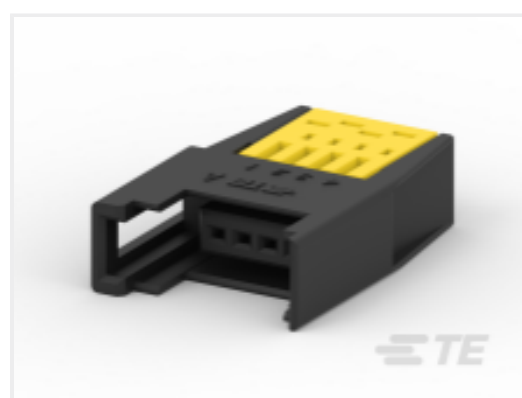
TE Part #2295321-4 RITS CONN. SOCKET ASSY 4P YELLOW TIN