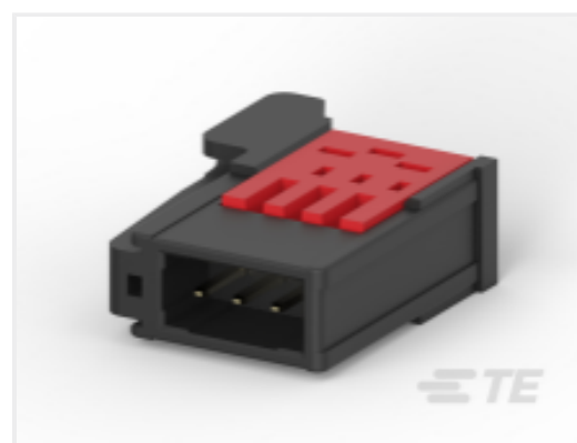
TE Part #1-2295044-3 RITS CONN. PLUG ASSY 3P RED TIN