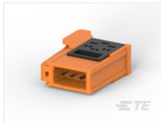
TE Part #3-2295044-3 RITS CONN. PLUG ASSY 3P ORANGE TIN