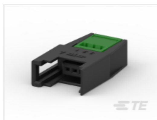
TE Part #4-2295321-3 RITS CONN. SOCKET ASSY 3P GREEN TIN