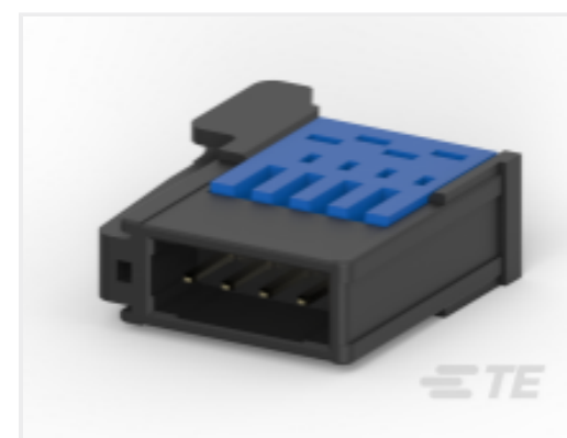
TE Part #2-2295044-4 RITS CONN. PLUG ASSY 4P BLUE TIN