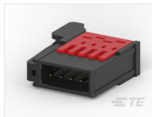
TE Part #1-2295044-4 RITS CONN. PLUG ASSY 4P RED TIN