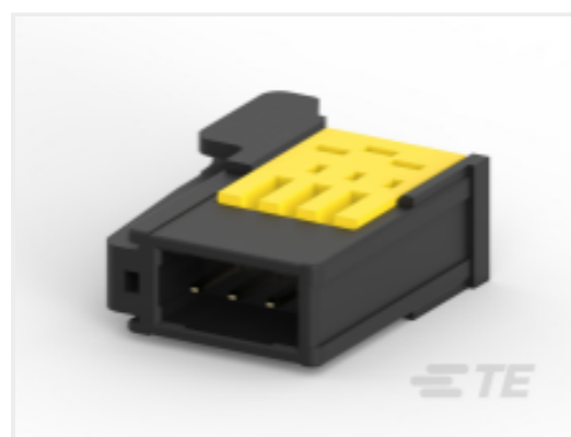
TE Part #2295044-3 RITS CONN. PLUG ASSY 3P YELLOW TIN