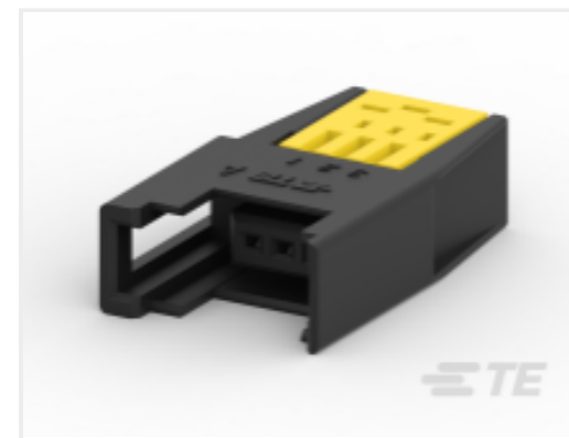
TE Part #2295321-3 RITS CONN. SOCKET ASSY 3P YELLOW TIN