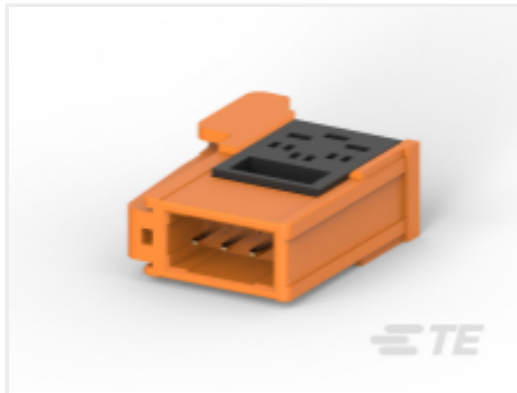
TE Part #3-2295044-3 RITS CONN. PLUG ASSY 3P ORANGE TIN