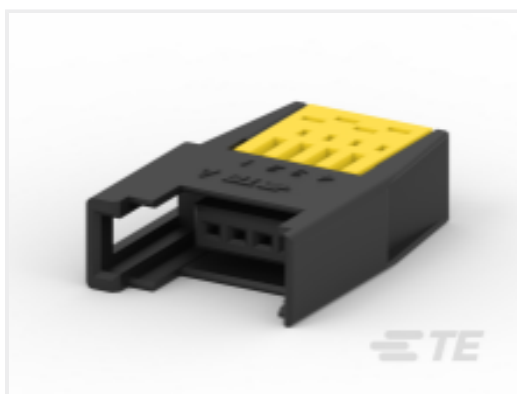
TE Part #2295321-4 RITS CONN. SOCKET ASSY 4P YELLOW TIN