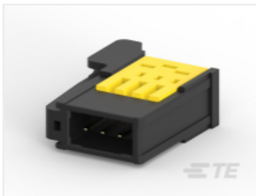
TE Part #2295044-3 RITS CONN. PLUG ASSY 3P YELLOW TIN