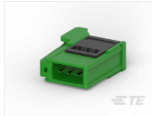
TE Part #4-2295044-3 RITS CONN. PLUG ASSY 3P GREEN TIN