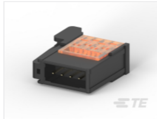
TE Part #3-2295044-4 RITS CONN. PLUG ASSY 4P ORANGE TIN