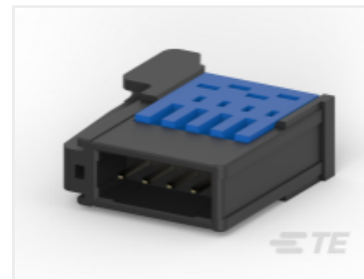
TE Part #2-2295044-4 RITS CONN. PLUG ASSY 4P BLUE TIN