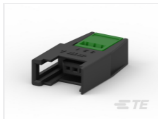
TE Part #4-2295321-3 RITS CONN. SOCKET ASSY 3P GREEN TIN