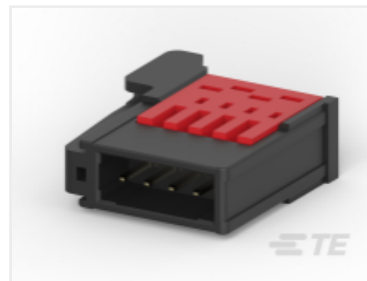
TE Part #1-2295044-4 RITS CONN. PLUG ASSY 4P RED TIN