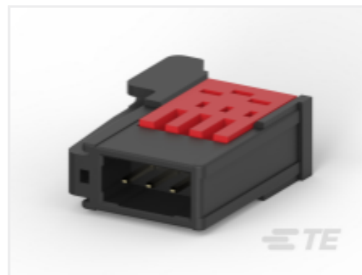
TE Part #1-2295044-3 RITS CONN. PLUG ASSY 3P RED TIN