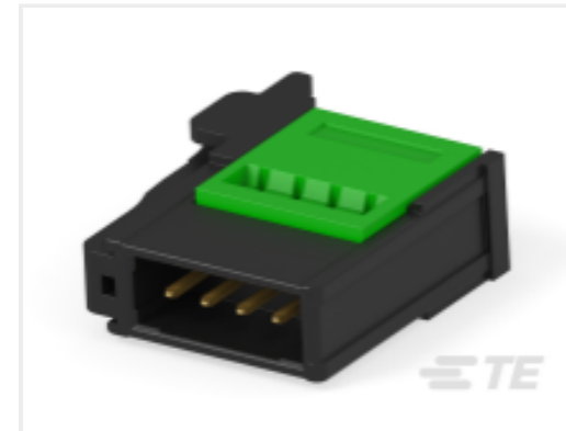
TE Part #4-2295044-4 RITS CONN. PLUG ASSY 4P GREEN TIN