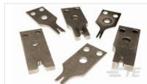
TE Part #3-1633730-2 CRIMPER, WIRE F .055F