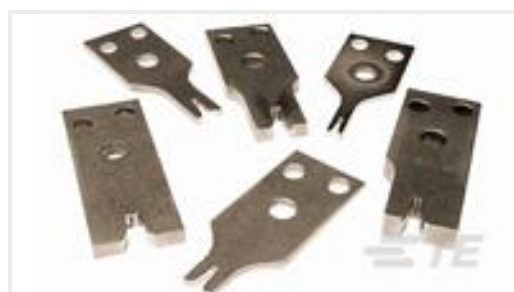
TE Part #1-562108-5 CRIMPER WIRE