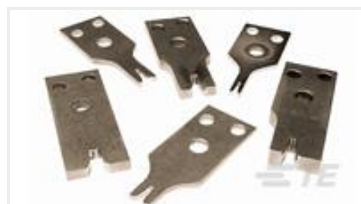
TE Part #2-456412-6 CRIMPER, WIRE .180 "F"