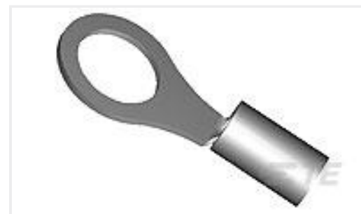
TE Part #35432 TERMINAL,SOLIS R 16-14HD 8