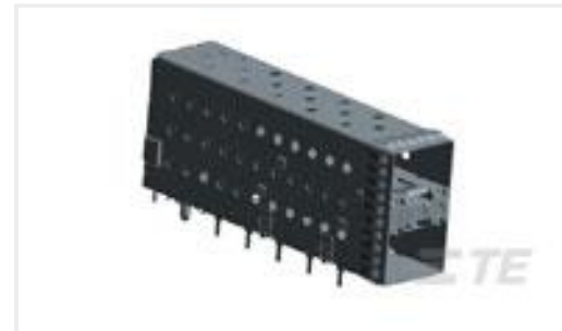
TE Part #1-2007492-5 SFP+assy 2x1 EMI Springs 4LP Sn Enhanced