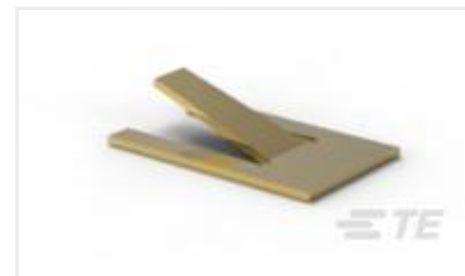
TE Part #1447009-5 SHIELD FINGER 0820 TYPE