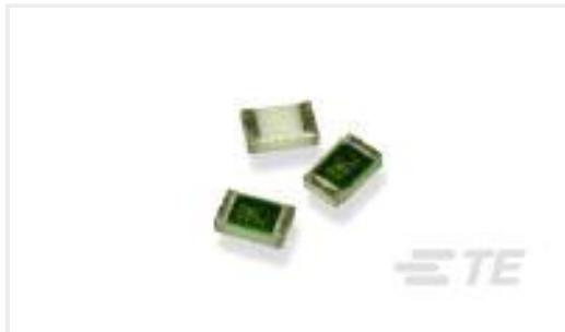
TE Part #9-1879208-7 CPF 0402 100K 0.1% 25PPM 1K RL