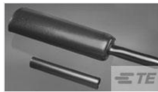
TE Part #420356-000 RMW-35/12-1200/ADH-0