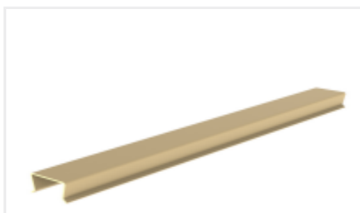
TE Part #2226808-2 COVER, MULTIGIG DAUGHTERCARD, 3U