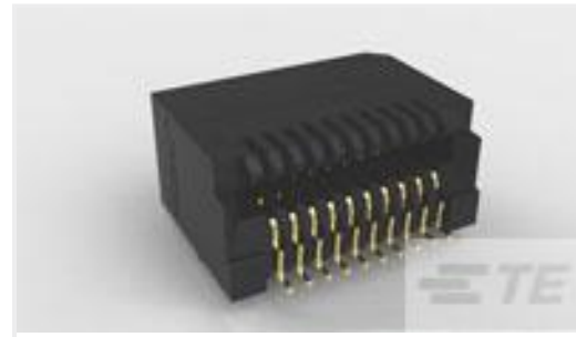
TE Part #1888247-1 20 POS SMT CONN, SFP/SFP+, 30A