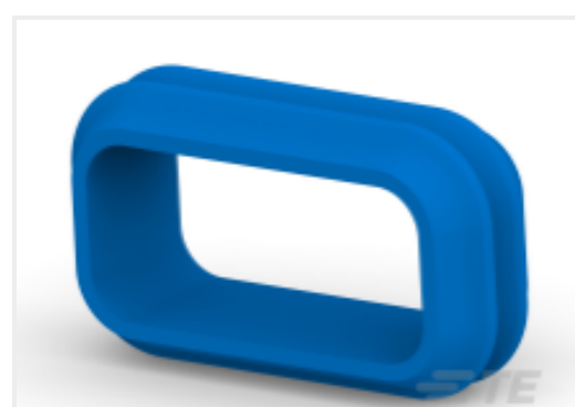
TE Part #CAT-526SDL-SEALSE Connector Seals: 2.55 mm, Signal Double Lock