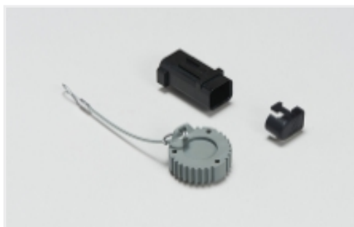
Automotive Connector Caps & Covers (15)