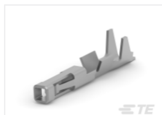
TE Part #CAT-526SDL-SEALTM Sealed Connector: Terminals, Signal Double Lock, 2.5 mm