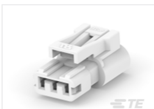
TE Part #CAT-526SDL-SEALHS Sealed Connector Housings: 2.5 mm, Signal Double Lock