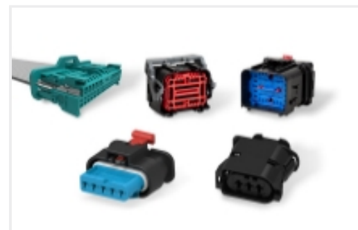
Automotive Signal & Power Connector Housings(321)