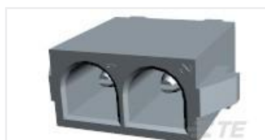
TE Part #350787-1 02P UMNL PIN HDR ASSY 94VO