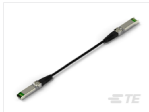
TE Part # 4-2821224-5 SFP56 DIRECT ATTACH CA, 3M, 26AWG