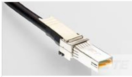
TE Part # 2142970-5 CABLE ASSY, MICRO SFP+ TO STD SFP+, 4M