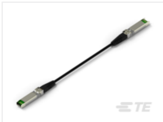
TE Part # 4-2334985-2 SFP56 DIRECT ATTACH CA, 1M, 32AWG