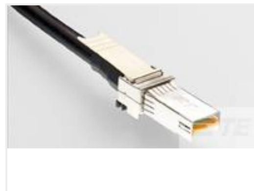
TE Part # 2142970-7 CABLE ASSY, MICRO SFP+ TO STD SFP+, 6M