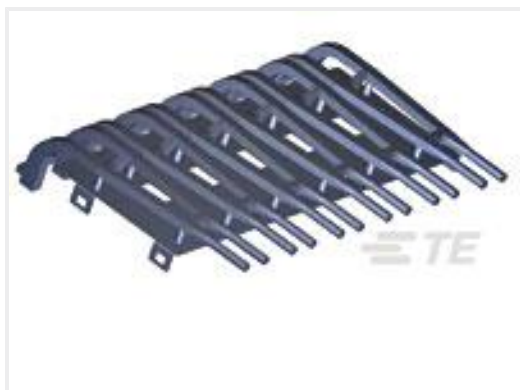
TE Part # 2110743-1 SFP 1x6 Light Pipe Assy, Low Profile