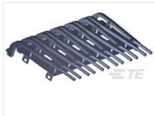
TE Part # 2007174-2 SFP 1x6 Light Pipe Assy, Reduced Length