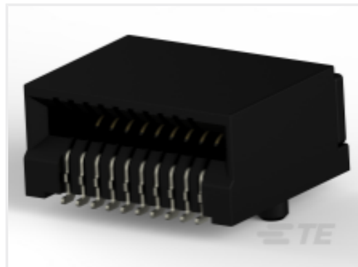
TE Part # 2110759-1 PT CONN ASSY 20 POS 16G SFP