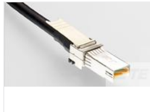
TE Part # 2142970-1 CABLE ASSY, MICRO SFP+ TO STD SFP+, 0.5M