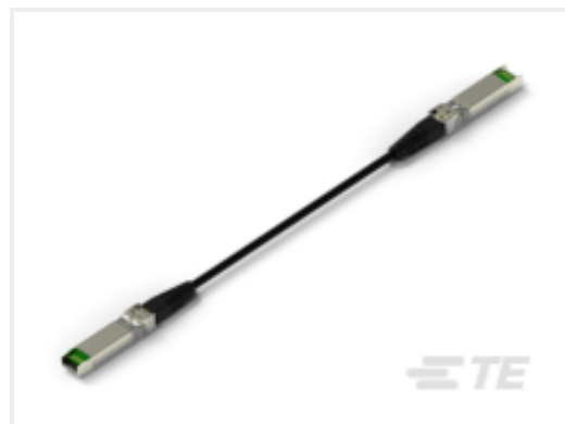
TE Part # CAT-C11-N4901114 SFP28 to SFP28 Cable Assembly: 30 AWG