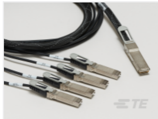
TE Part # 2821033-8 OSFP TO [4]SFP+, 28G, 1M, 33AWG