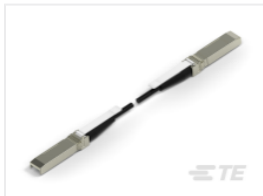
TE Part # CAT-C11-H5062 SFP+ to SFP+ I/O Cable Assembly: 28 AWG