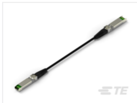
TE Part # 4-2821222-5 SFP56 DIRECT ATTACH CA, 2M, 30AWG