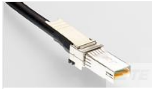
TE Part # 2142970-6 CABLE ASSY, MICRO SFP+ TO STD SFP+, 5M