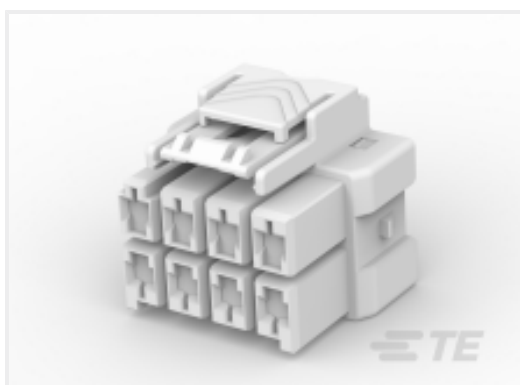
TE Part #CAT-P87074-P729 POWER TRIPLE LOCK Plug, Standard Temperature