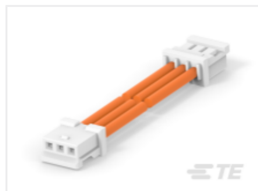
TE Part #2405417-3 3P TO 3P 300MM CABLE ASSEMBLY, 1775441-3