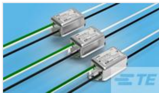
TE Part #8-1609095-9 2FB3=F8361