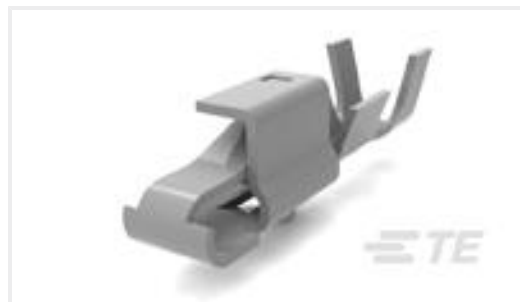
TE Part #3-770476-1 SL156 RECPT, SNNI/PHBZ