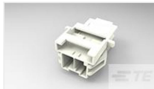
TE Part #1-1971772-2 PTL 1X2 CAP PANEL MT STD TEMP KEY A NAT