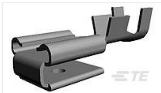
TE Part #61944-2 250 FASTON REC 18-14 AWG TPBR