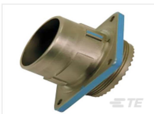
TE Part #YDIV40E25-19PBC009 RECP ASSY