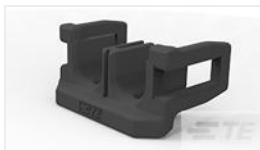
TE Part #1971777-2 PTL TPA HIGH TEMP 1 x 2 BLACK