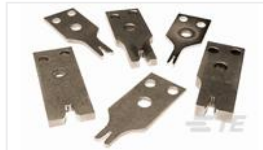
TE Part #1803179-2 CRIMPER, WIRE F PREMIUM