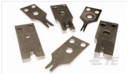
TE Part #1633965-8 CRIMPER, INSUL O PREMIUM