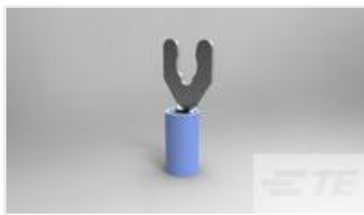
TE Part #52936-1 TERMINAL,PIDG SPR SPD 16-14 8