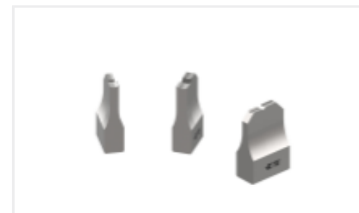
ANVIL REPRESENTATION ONLY