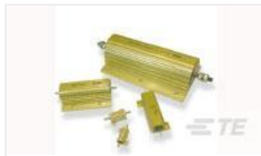
TE Part #8-1625963-5 HSA5 150R 5%