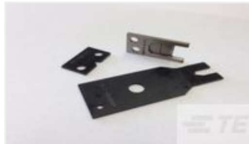
TE Part #2217206-7 Blade, Slug