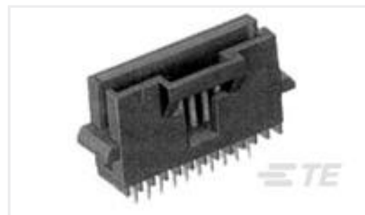
TE Part #5-146085-1 10 SYSTEM 50 HDR SRST SHRD SN