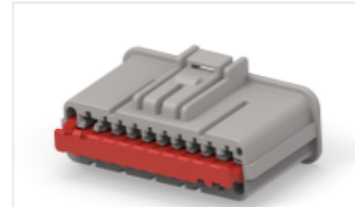
TE Part #2098377-2 20P PLUG ASSEMBLY UNSEALED HYBRID B-KEY