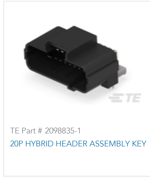
TE Part # 2098835-1 20P HYBRID HEADER ASSEMBLY KEY