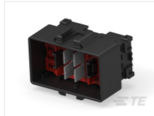
TE Part #2317734-1 92POS,SOC HSG,CCS,UNSLD,COD 1