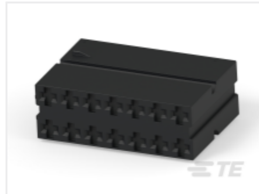
TE Part #2209893-1 BCM 14P MCP2.8 SOCKET