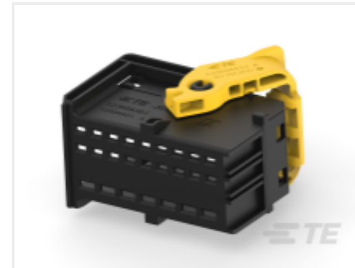
TE Part #2378779-1 PLASTIC CARRIER,25POS,CODE A