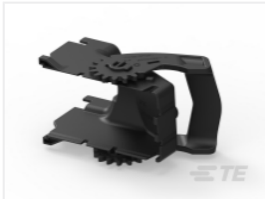
TE Part #2208729-1 COVER,OUTGOING VERTICAL,ASSY