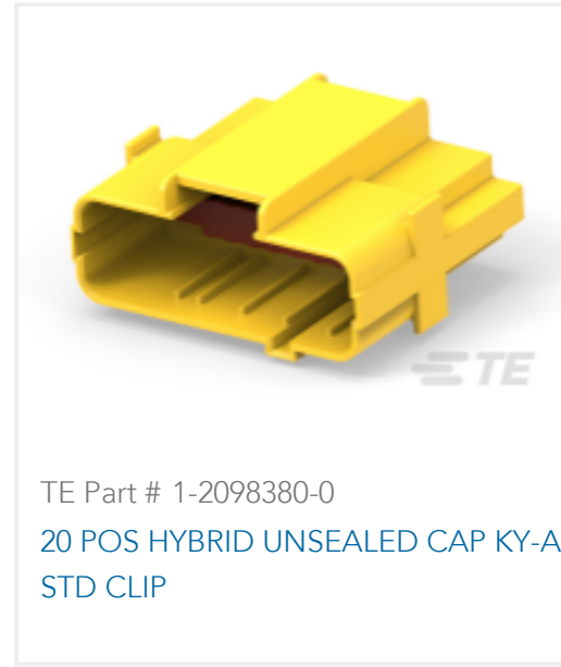
TE Part # 1-2098380-0 20 POS HYBRID UNSEALED CAP KY-A STD CLIP