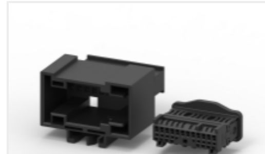
TE Part #CAT-M8793-CH8172 MQS, CONNECTOR HOUSING