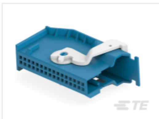
TE Part #2177836-2 COVER, 32POS. MQS, REVERSE,ASSY