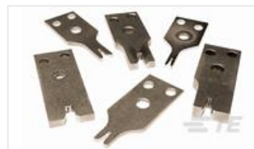
TE Part #2-1633966-9 CRIMPER, INSULATION O