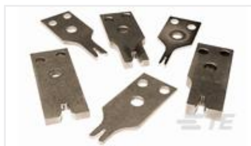
TE Part #2-1333281-7 CRIMPER, WIRE, F PREMIUM (.042")