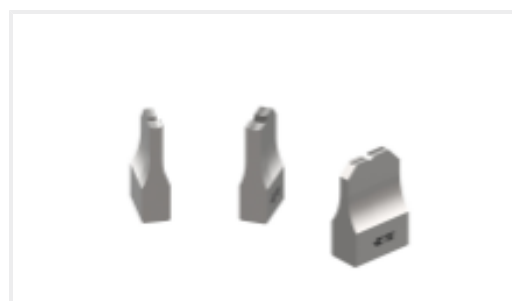
TE Part #6-1633620-7 ANVIL, COMBINATION