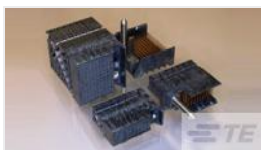
TE Part #2057411-1 IMP100S,R,RA2P16C,UG,39