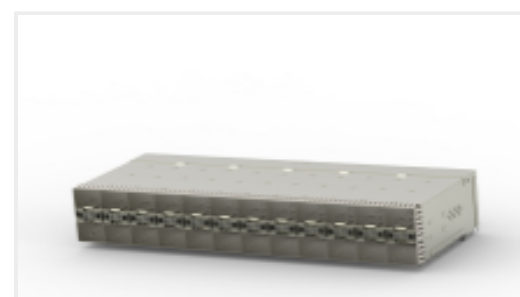
TE Part #2227838-7 2X12 ZSFP+ CONNECTOR ASSEMBLY