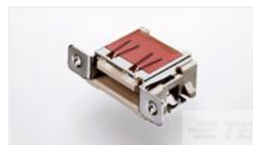
TE Part # 353929-1 Std USB Type A, R/A, SMT, Offset, Panel