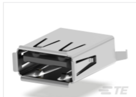
TE Part # 1734366-3 Std USB Type A, VT, T/H, Blue