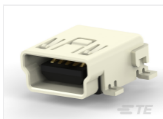
TE Part # 1734035-4 MINI USB, TYPE B, R/A, SMT, MYLAR