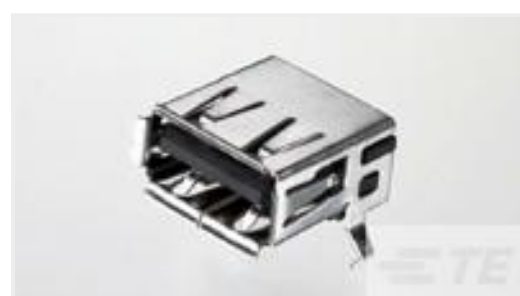
TE Part # 1-292303-5 Std USB Type A, R/A, T/H