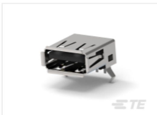
TE Part # 292303-5 Std USB Type A, R/A, T/H, Natural