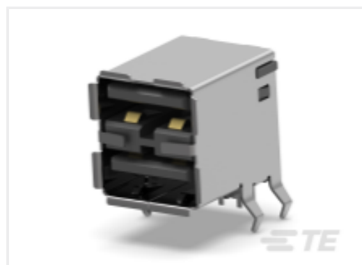
TE Part # 5787745-5 USB A R/A STAK ASSY THRU HOLE