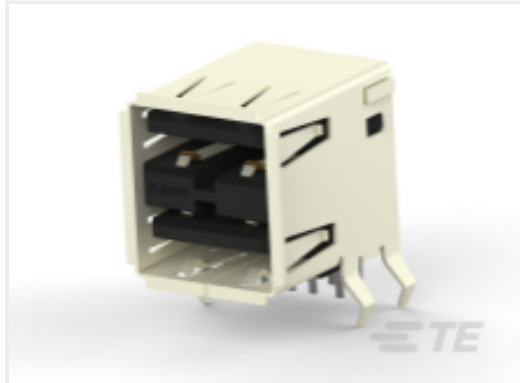
TE Part # 5787617-1 RECP ASSY, R/A, STACKED, THRU-HOLE, USB,