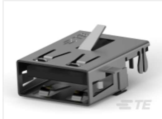
TE Part # 1746311-1 Std USB Type A, R/A, T/H