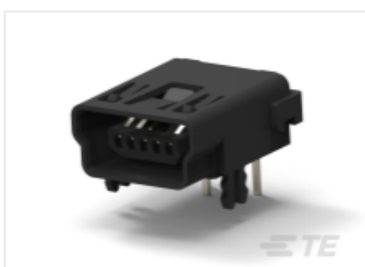
TE Part # 1734510-2 MINI USB, TYPE B, R/A, T/H