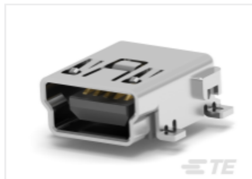
TE Part # 1-1734035-2 MINI USB, TYPE B, R/A, SMT