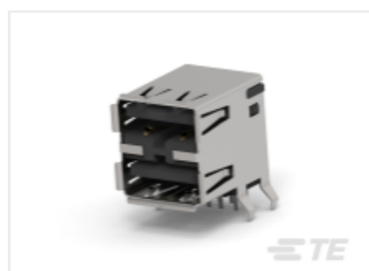
TE Part # 292323-5 RECEPTACLE ASSY RIGHT ANGLE STACKED THRU