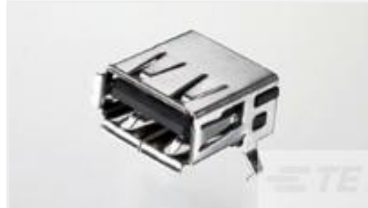
TE Part # 1-292303-4 Std USB Type A, R/A, T/H