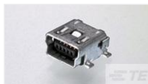
TE Part # 2-1734035-3 MINI USB, TYPE B, R/A, SMT