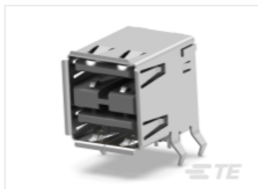
TE Part # 5787617-5 RECP ASSY, R/A, STACKED, THRU-HOLE, USB,