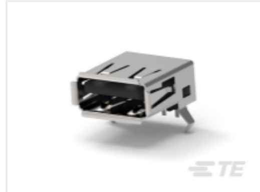
TE Part # 292303-2 Std USB Type A, R/A, T/H