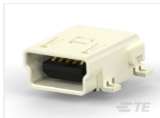
TE Part # 1734035-2 MINI USB, TYPE B, R/A, SMT