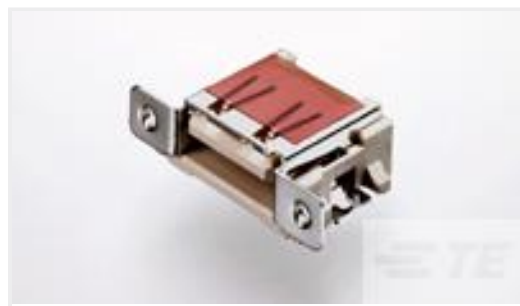
TE Part # 353929-6 Std USB Type A, R/A, SMT, Offset, Panel