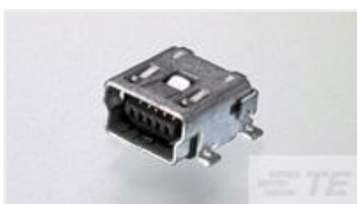
TE Part # 1-1734035-3 MINI USB, TYPE B, R/A, SMT