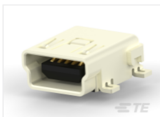
TE Part # 1734035-1 MINI USB, TYPE B, R/A, SMT