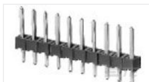
TE Part #7-146277-0 20 MODII HDR SRST B/A .100CL