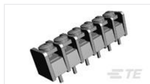
TE Part #2-1437667-9 4DB-P108-06=4DB ASSEMBLY