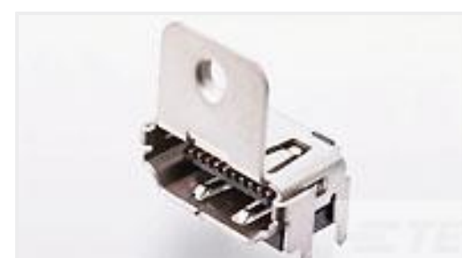
TE Part #2-1747981-3 Std HDMI, RA, SMT, Panel grd, Flange