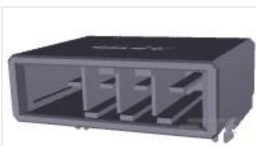
TE Part #1-179277-2 DYNAMIC 3200 HDR ASSY 4P H PdNi & Au