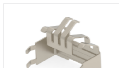
TE Part #6-1447140-5 3900022-00=FGCONTACT PACK