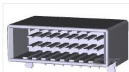
TE Part #178307-3 DYNAMIC D3100 HDR ASSY 16P PdNi PL