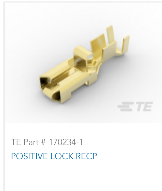
TE Part # 170234-1 POSITIVE LOCK REC