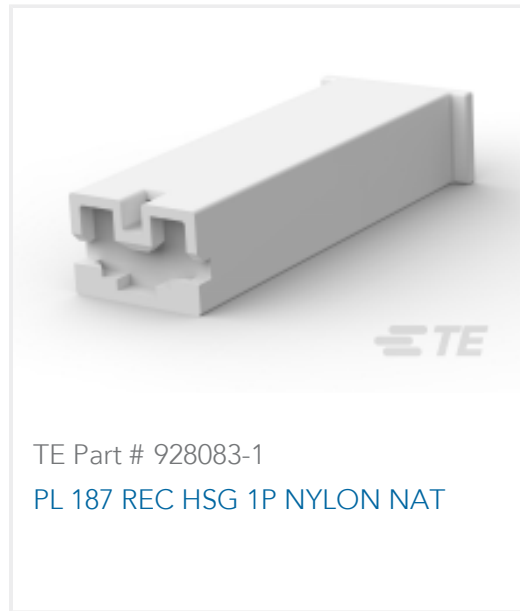
TE Part # 928083-1 PL 187 REC HSG 1P NYLON NAT