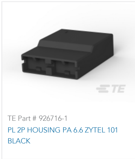
TE Part # 926716-1 PL 2P HOUSING PA 6.6 ZYTEL 101 BLACK