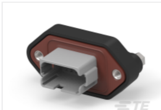
TE Part #DT04-12PA-BL11 REC, 12P, GRY, E, ENH KEY, CAP, FLANGE,A