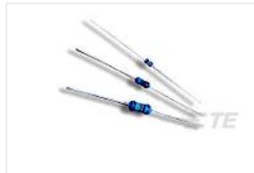
TE Part #7-1622796-1 YR1 0.1% 165K