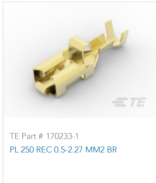
TE Part # 170233-1 PL 250 REC 0.5-2.27 MM2 BR