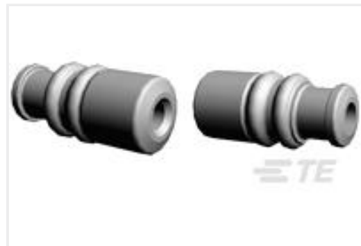
TE Part #1-900325-9 070 RUBBER PLUG M