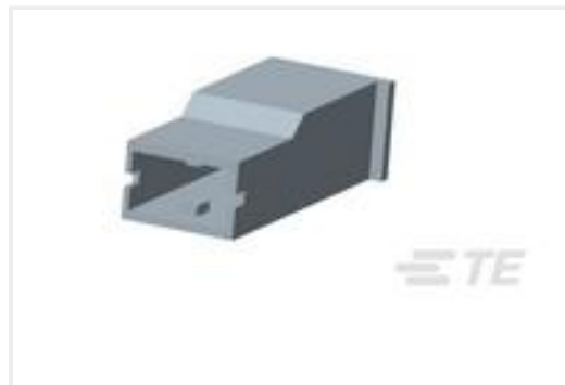
TE Part #171809-2 POSITIVE LOCK (PL) HOUSING