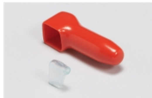
Insulation Boots & Sleeves(5)