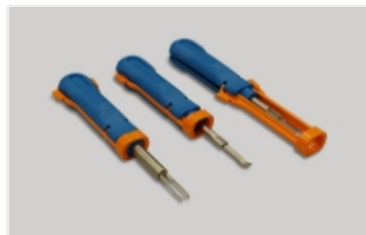
Insertion & Extraction Tools(3)