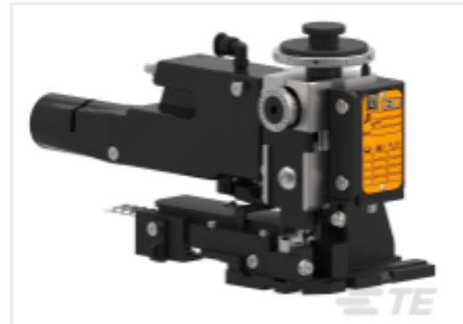
TE Part #2837428-2 OCEAN_2.0_Applicator-S-062F071O-A-RSA