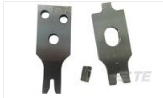
TE Part #7-2151139-7 OCEAN_2.0_SPARE_PART_KIT-080F160OV