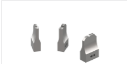
ANVIL REPRESENTATION ONLY