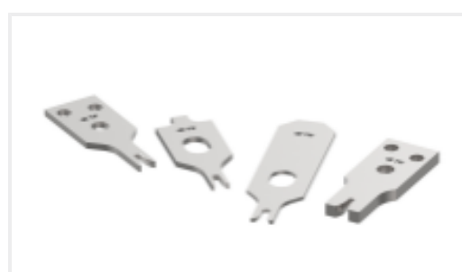
TE Part #5-1633860-6 CRIMPER, WIRE F