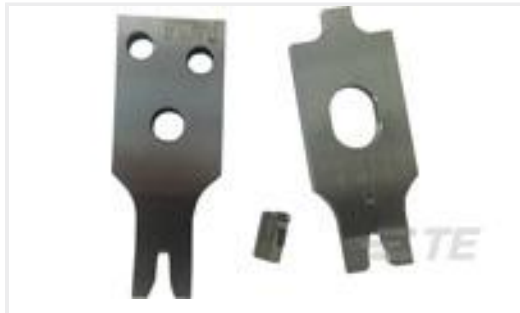
TE Part #7-2151039-7 OCEAN_2.0_SPARE_PART_KIT-080F100O