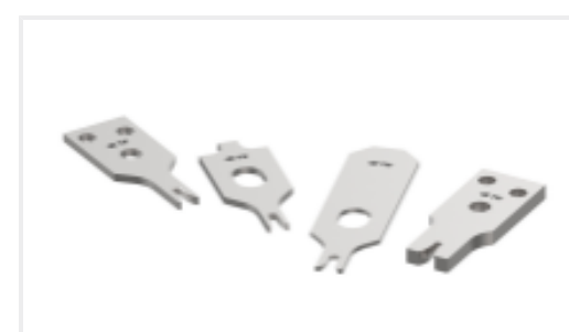
TE Part #1803126-2 CRIMPER, WIRE F NON-TYPICAL RK VALUES