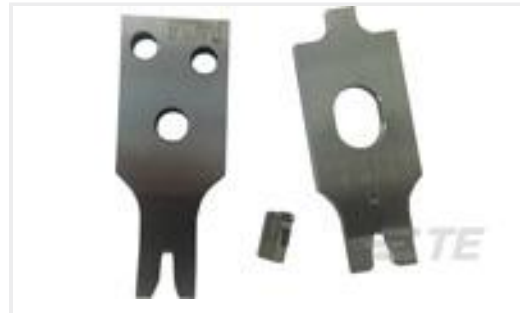
TE Part #7-2151469-7 OCEAN_2.0_SPARE_PART_KIT-055F125O