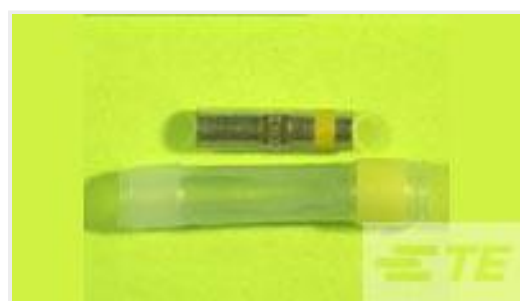
TE Part #650110-000 D-436-0128