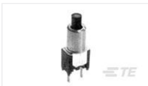
TE Part #1825100-1 TPF11CGPC004