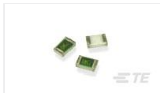
TE Part #1676247-3 RN 0805 200R 0.1% 10PPM 5KRL