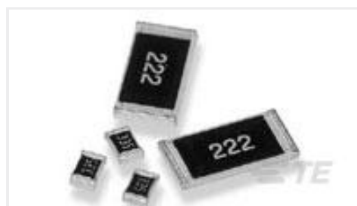
TE Part #1623693-1 CRG1206 ZEROHM