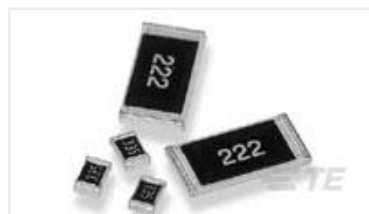
TE Part #1-2176177-9 CRGH0603 1% 4K7 0.2W