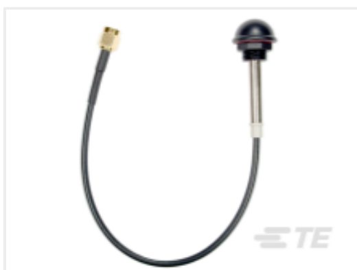
TE Part #ANT-DB1-WRT-RPS Antenna Dome WiFi6 2.4/5.8GHz RG174 RPS