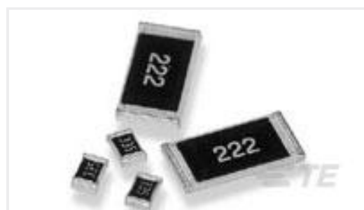
TE Part #2176177-7 CRGH0603 1% 470R 0.2W